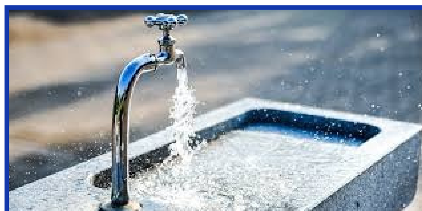
Good Water Supply