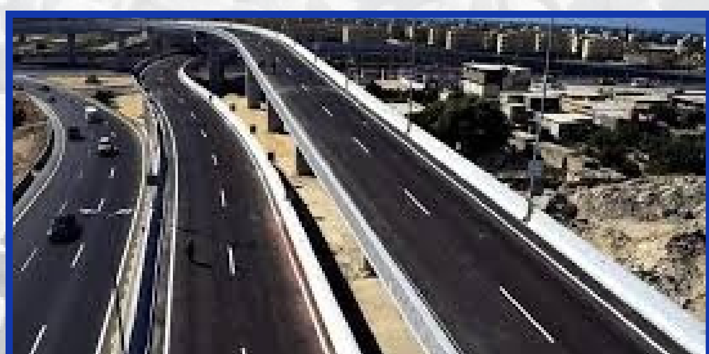
Seamless Road Network