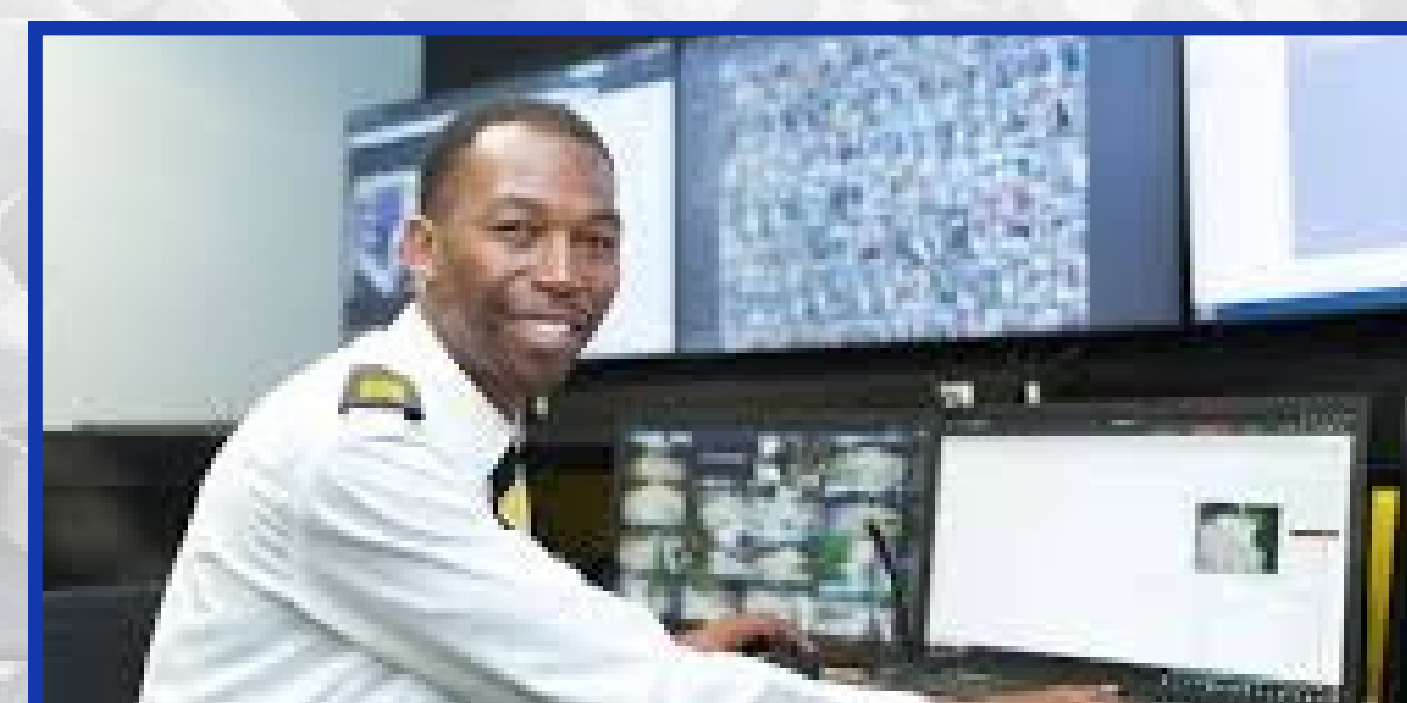
24 Hour Security