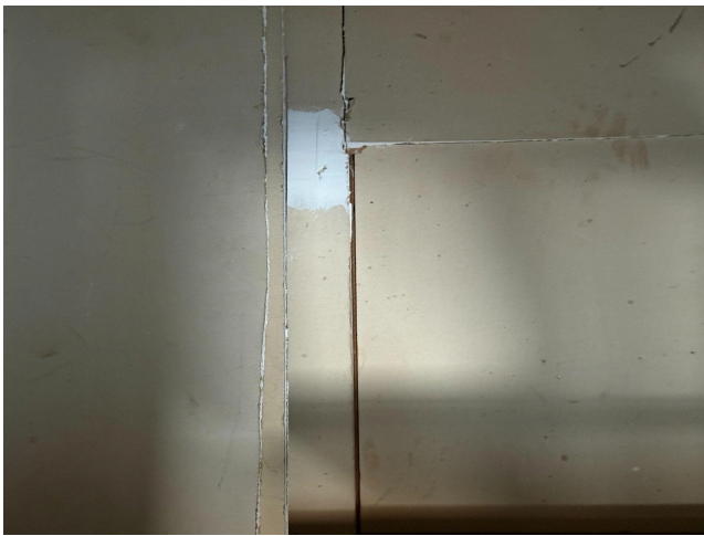
3. Attic - compromised firewall, open tape joints, unable to determine if patched sections are fire-rated drywall