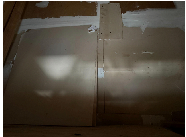
2. Attic - compromised firewall, open tape joints, unable to determine if patched sections are fire-rated drywall