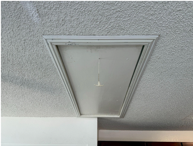
1. Attic pull-down ladder - not approved, not fire-rated type