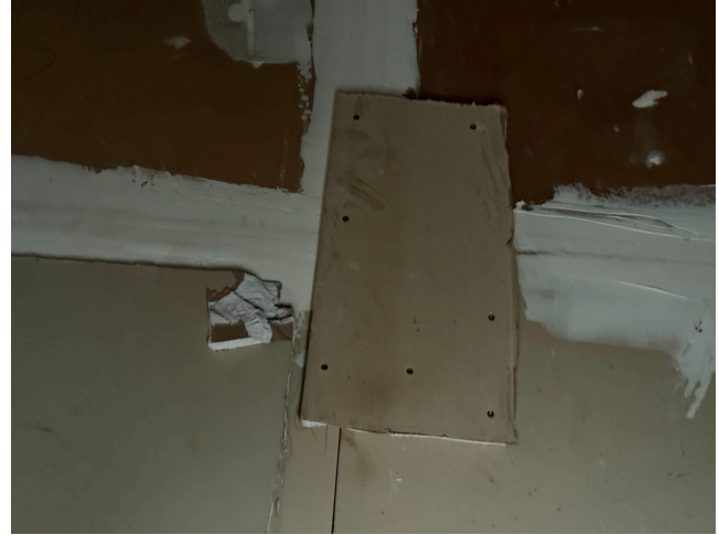
4. Attic - compromised firewall, open tape joints, unable to determine if patched sections are fire-rated drywall