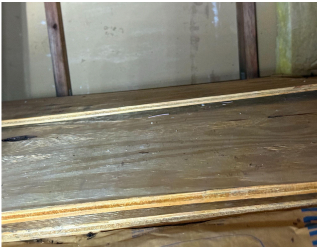
5. Plyboard sections used for storage items