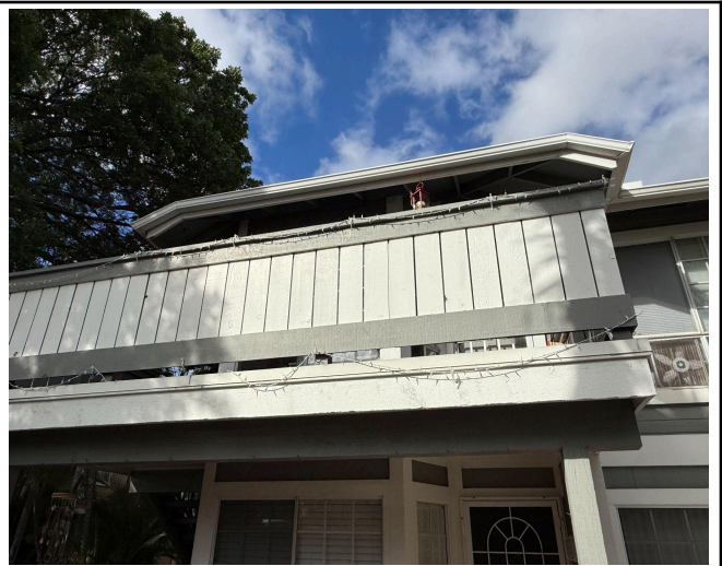
8. String Lights