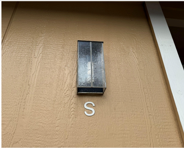
4. Porch Light