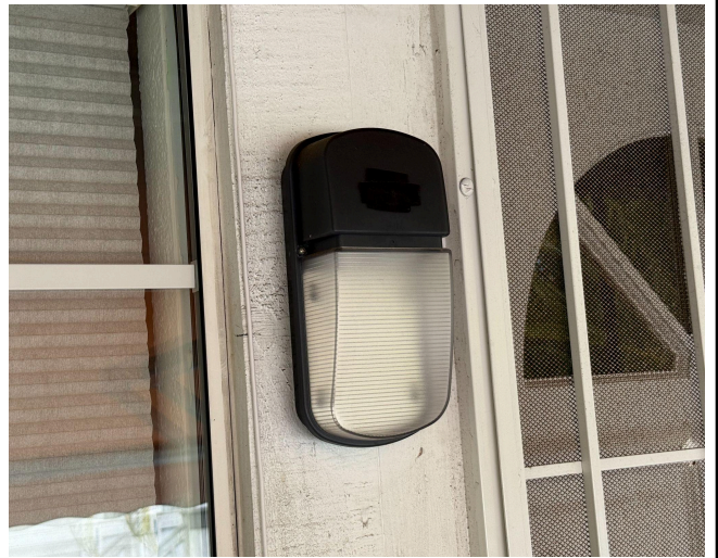
12. Porch Light