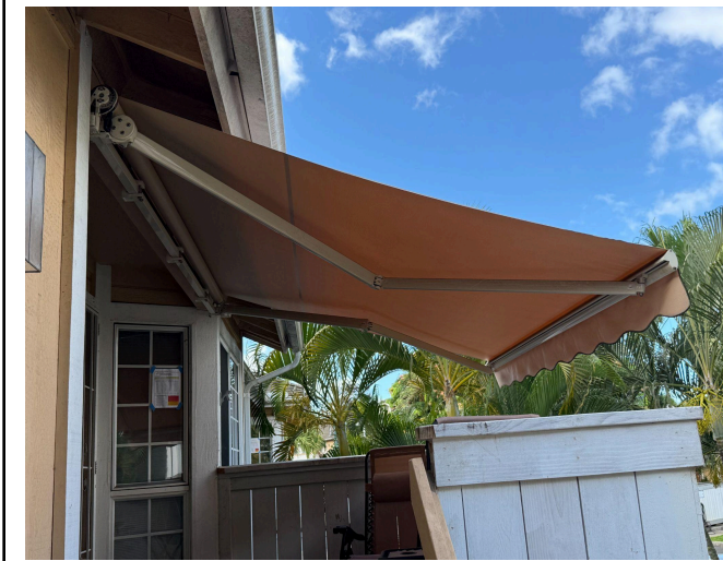
11. Lanai Canopy