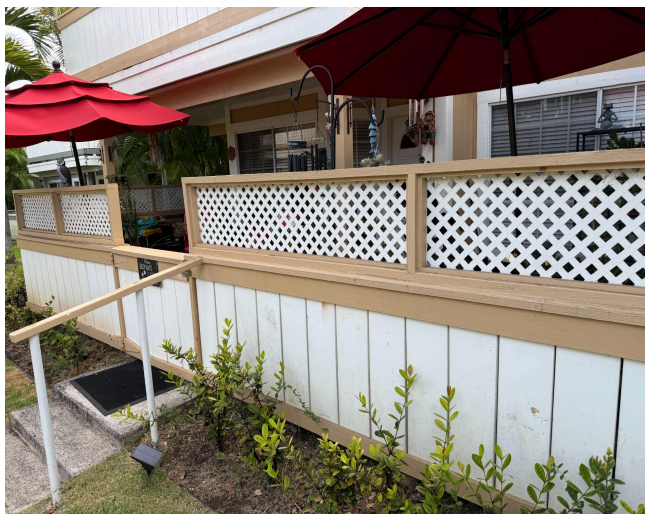
6. Pet Barrier