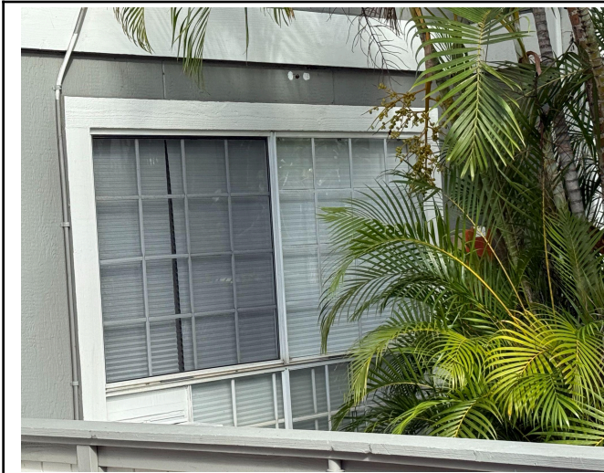
7. Window Coverings