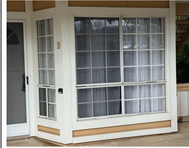
5. Window Coverings