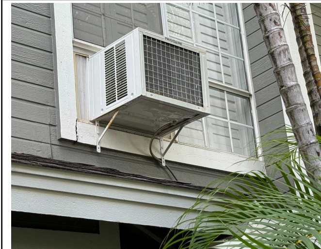
9. AC unit- Window