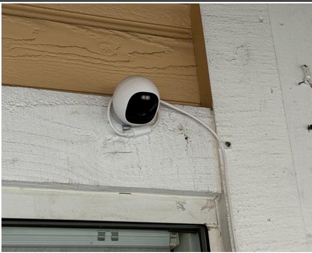
13. Security Camera