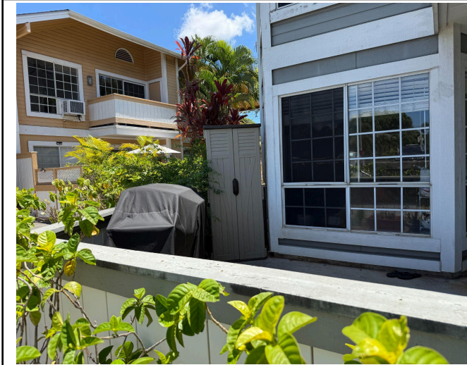
3. Unapproved storage shed