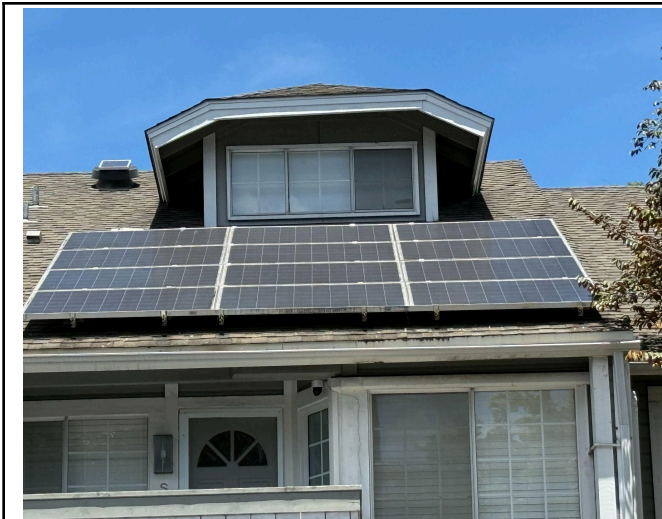
1. PV System