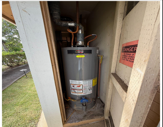
10. Water Heater (Gas only)