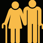
Senior Citizen Sit-Out