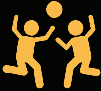
Kids Play Garden

Experience a lifestyle of exceptional amenities for all ages. Enjoy a luxurious Community Centre, a dedicated Kids Play Garden, Badminton & Basketball Courts, a Cricket Pitch and an Outdoor Gym. Relax on the Yoga Lawn, enjoy entertainment at the open-air Amphitheatre or unwind in our serene Aerobic Garden, Senior Citizen Sit-Out, and Outside Library.