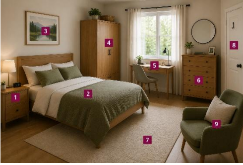
Bed | Bedside table | Carpet | Chair | Chest of drawers | Desk | Door | Picture | Wardrobe