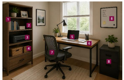
Bookcase | Boxes | Cabinet | Chair | Desk | Laptop | Picture | Printer