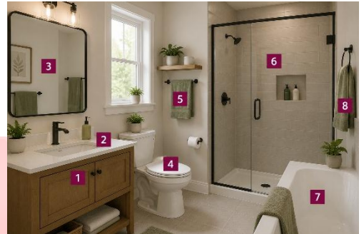
Basket | Bath | Cabinet | Mirror | Shower | Sink | Toilet | Towel