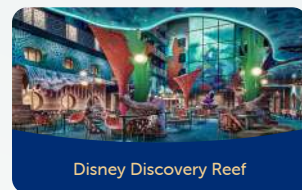
Disney Discovery Reef