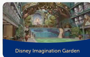
Disney Imagination Garden