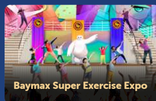
Baymax Super Exercise Expo