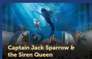
Captain Jack Sparrow & the Siren Queen