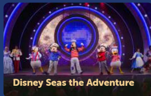
Disney Seas the Adventure

A heartfelt musical starring WALL-E and beloved Disney and Pixar Characters. More dazzling Broadway-style productions—including exclusive shows for the Disney Adventure —await at breathtaking venues across the ship.