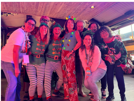
The OCPHC members brought coats, jackets and blankets for the Boys and Girls Club.