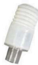
6002 Test Lung Neonatal