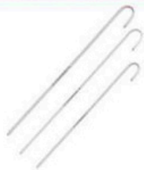
3200-3202 Stylet (Adult, Pediatric, Neonatal)