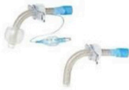
Tracheostomy Tube Flexomatalic