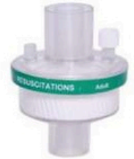
1600-1602 HME Filter