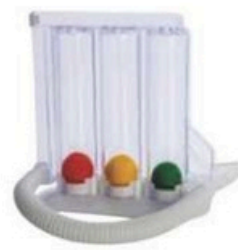
9989 Respiratory Exerciser