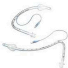
RAE Tube Oral Nasal North Pole South Pole