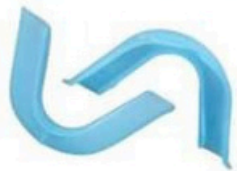
9997 Tooth Protector