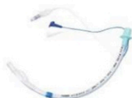
Subglottic Tracheal Tube Cuff (Suction)