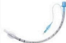
Reinforced - Flexometalic Endotracheal-tube Cuff-plain