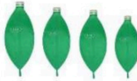
7005-7120 Rebreathing Bag