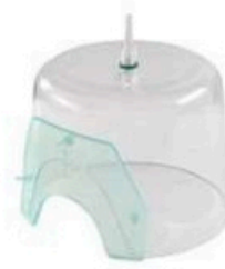
4800-4802 Oxygen Hood