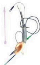
LMA Block Buster