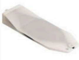
6000 Test Lung Adult