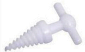
9997 Mouth Opener