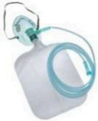
1004-1005 High Concentration Oxygen Mask (Adult / Paediatric)