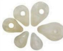
4100-4105 Silicone Anaesthesia Face Mask (0-5)