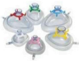
4400-4405 Air Cushioned Anaesthesia Face Mask (0-5)