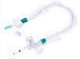
Suction Catheter Closed System