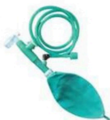
2002-2006-2007 Anaesthesia Breathing Systems (Mapleson-C)