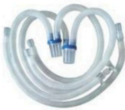
2400-2402 Breathing Systems Ventilator Circuit (Double Water Trap) (Adult, Paediatric, Neonatal)