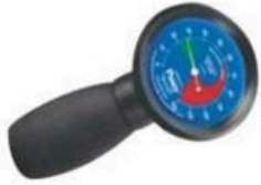
ETT Cuff Pressure Gauge