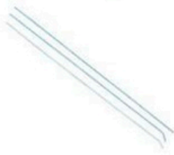
3300-3305 Bougie (Adult, Paediatric, Neonatal)