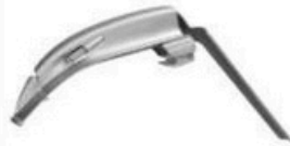
3022-3024 Flexitip McCoy Type Laryngoscope Blade Size 2,3,4