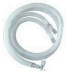
2100-2102 Breathing Systems Ventilator Circuit Plain (Adult, Paediatric, Neonatal)