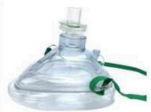
4501 CPR Mask