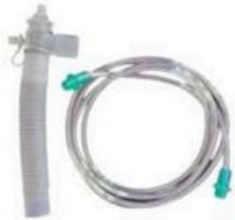
1401-1402 T-Oxygen Recovery Kit