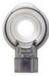
8101 PEEP Valve Diverter