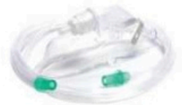
1000-1001 Oxygen Mask (Adult / Paediatric)