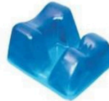
Prone Head Rest Silicon Gel