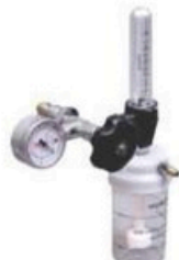
9991 Flowmeter (FA Valve / BPC)