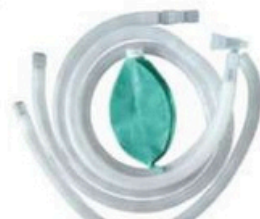
2200-2208 Anaesthesia Breathing Systems Close Circuit (Adult/Paediatric)