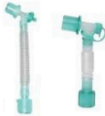
1500-1501 Catheter Mount