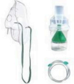
1300-1302 Nebulizer Kit (Adult/ Paediatric)