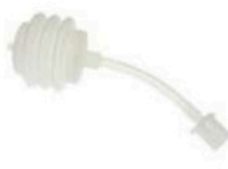
6001 Test Lung Paediatric