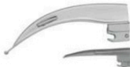
3017-3021 Fiber Lite Laryngoscope Blade Size (0,1,2,3,4)