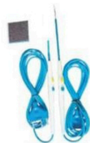
9990-9991 ESU Cautery Pencil (Normal and Long Tip with Tip Cleaner)