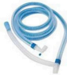
Single Limb-O-Limb Circuit