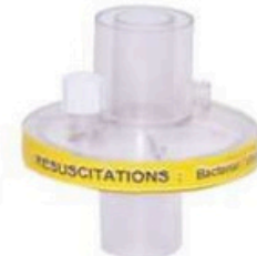
1605 Bacteria Viral Filter