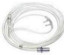
1100-1120 Nasal Cannula (Adult, Pediatric, Neonatal) 2, 5,10,15,20 (Mtr.)