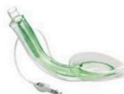
Ambu AuraGain Laryngeal Mask