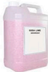
Soda Lime CO2 Absorbent (Pink to White & White to Violet)