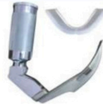
3035 Laryngoscope Set with Stubby Short Handle 45 Degree