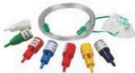
1006-1009 Venturi Mask with Valve (Adult/ Paediatric)