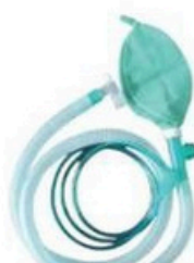
2003 Anaesthesia Breathing Systems (Mapleson-D) Bain's Circuit (Adult)