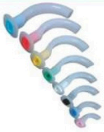
5000-5106 Guedel-Oropharyngeal-Airway (Size : 000,00,0,1,1.5,2,3,4,5)