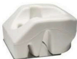
Prone Head Rest