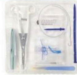
Percutaneous Tracheostomy Kit