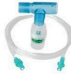
1400 Ventilator T Neb Kit