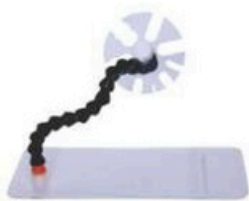
9999 Breathing System Tube Holder / Support