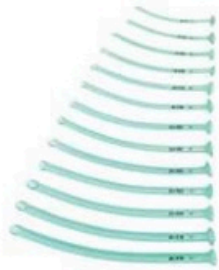
5230-5290 Nasopharyngeal Airway