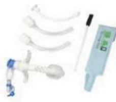
Trachetomy Tube Inner Tube- With Fenestrated Type