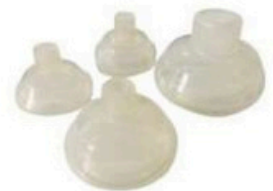
4200-4206 Silicone Circular Face Mask (00,0,1,2)