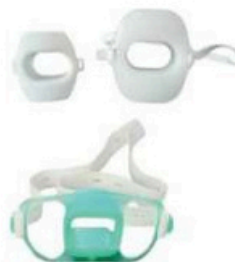
9995-9996 Endoscopy Bite Block Intubation/Laryngoscopy