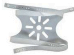
4500 Mask Harness