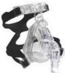
4600-4605 NIV Mask Vented/Nonvented (Large, Medium, Small)