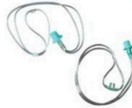
1200-1203 Resus Cannula (Adult, Pediatric, Neonatal)