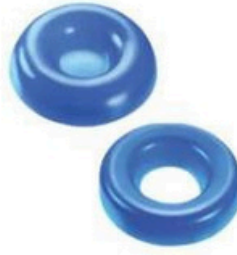
Head Rest Silicone Gel