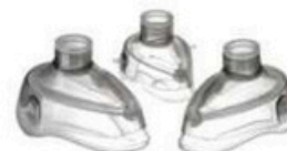
4503-4505 Silicone Flaped Hooded Mask (3,4,5)