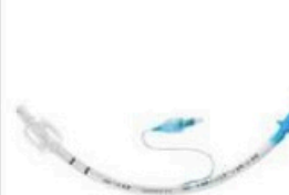
Microlaryngeal Tube MLT Tube 4-5-6