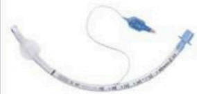
Endotracheal Tube Cuff-plain