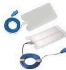
9995-9996 Cautery Pad