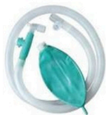
2001 Anaesthesia Breathing Systems (Mapleson-A)