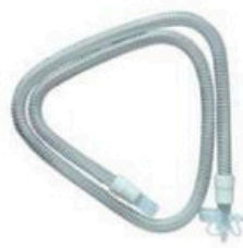
2000 BiPap Breathing Systems