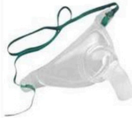
1010-1011 Tracheostomy Mask