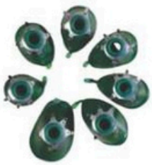
4000-4006 Anatomical Anaesthesia Face Mask (0-6)