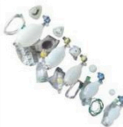
8000-8004 Silicone Resuscitator