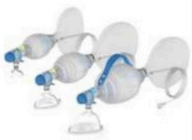
Resuscitator Bag (Vinyl)