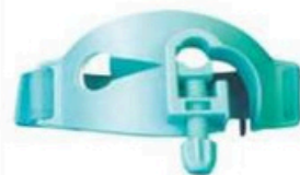
9998 Tracheal Tube Holder