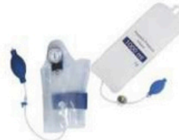
Reusable / Disposable Pressure Infusion Bag