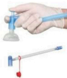
Resuscitation T-Piece Circuit