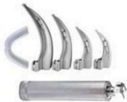
3039 Laryngoscope Set of 4 Macintosh Blade + Standard Handle