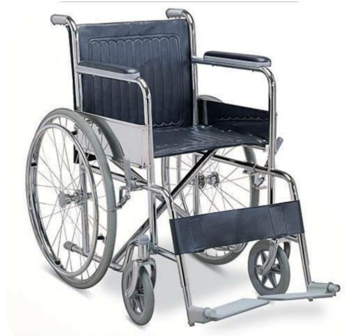
Wheel Chair - Foldable