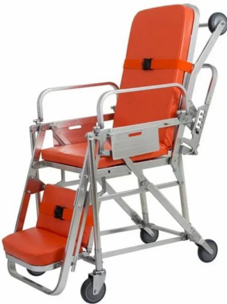
Stretcher Cum Wheel Chair