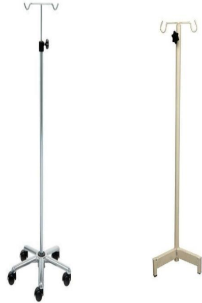
IV stand with and without Wheel