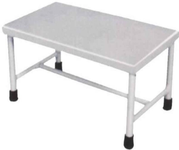
Foot Stool – Single Step

Your One-Stop Solution, Everything Your Hospital Requires GST NO: 33ATMPP2166R1ZY