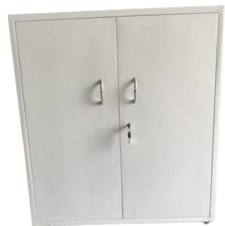
Steel Almirah - Small