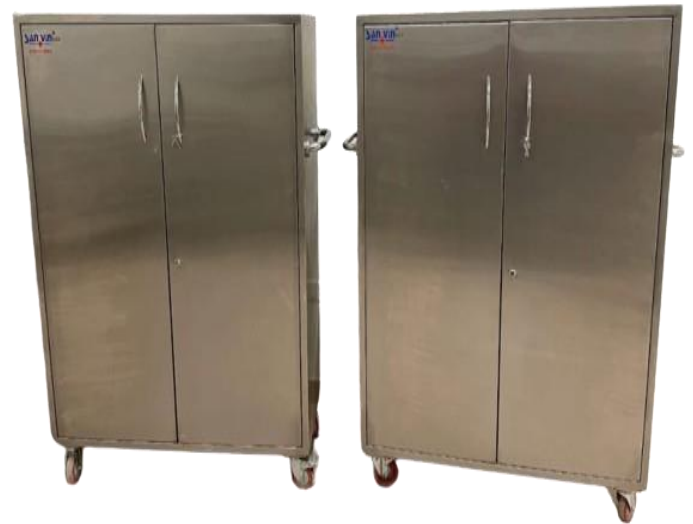
Closed Instrument Trolley