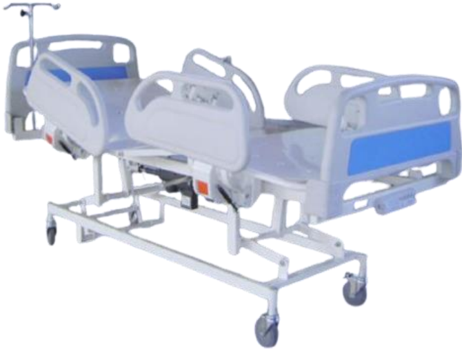
ICU Bed with Mattress

Your One-Stop Solution, Everything Your Hospital Requires GST NO: 33ATMPP2166R1ZY