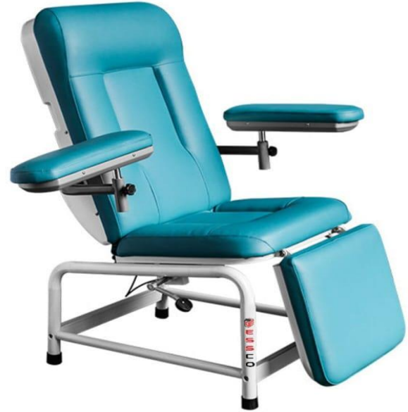
Blood Donor Chair