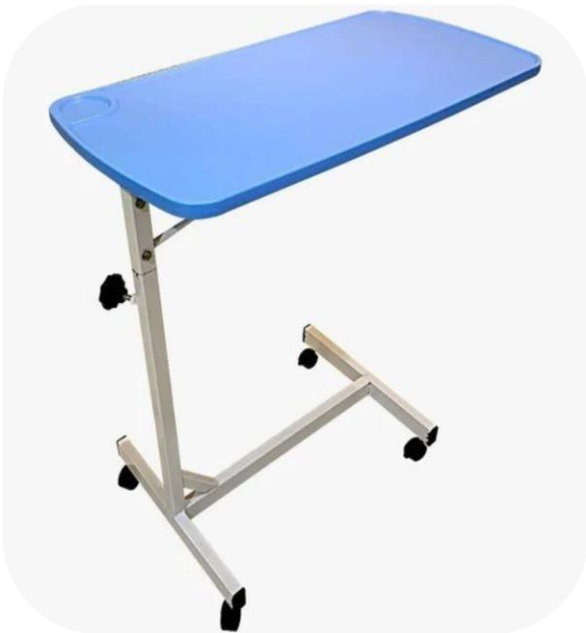
Cardiac and Overbed Table