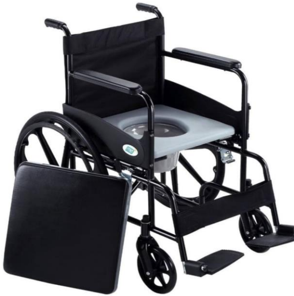
Commode Wheel Chair

Your One-Stop Solution, Everything Your Hospital Requires GST NO: 33ATMPP2166R1ZY