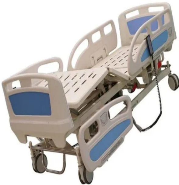
Electronic Cot – 5 Function

Your One-Stop Solution, Everything Your Hospital Requires GST NO: 33ATMPP2166R1ZY