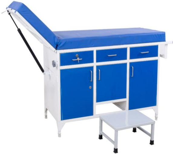
Investigation Table with Drawer

Your One-Stop Solution, Everything Your Hospital Requires GST NO: 33ATMPP2166R1ZY