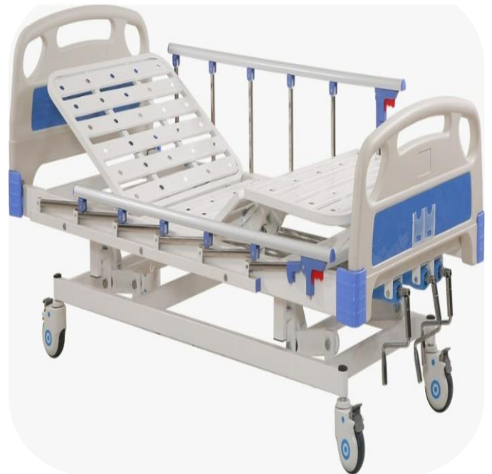
Fowler Bed – Multi Function