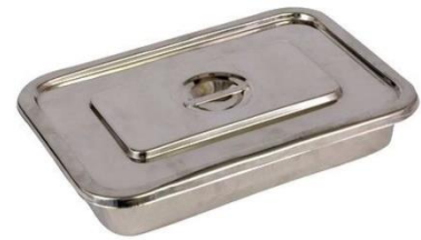
Dressing Bin & Tray