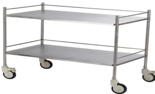
Open Instrument Trolley