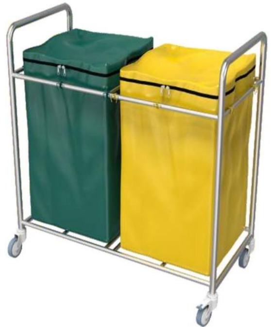
Solid Line Trolley - Double