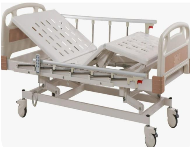
Electronic Cot – Single Function