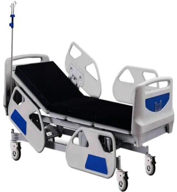
Electronic Cot – Multi Function