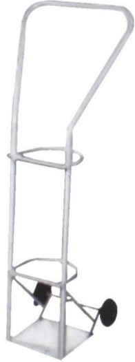
O2 Cylinder Trolley

Your One-Stop Solution, Everything Your Hospital Requires GST NO: 33ATMPP2166R1ZY