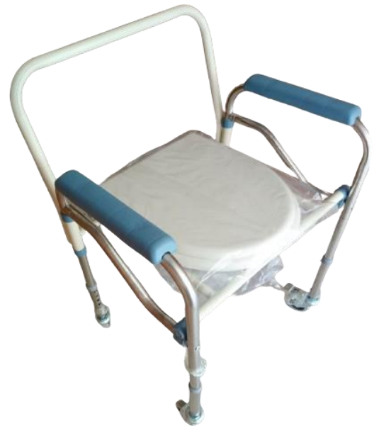
Commode Folding Stool