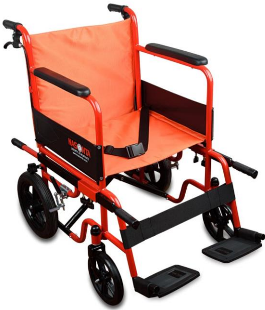
Wheel Chair - Fixed

Your One-Stop Solution, Everything Your Hospital Requires GST NO: 33ATMPP2166R1ZY