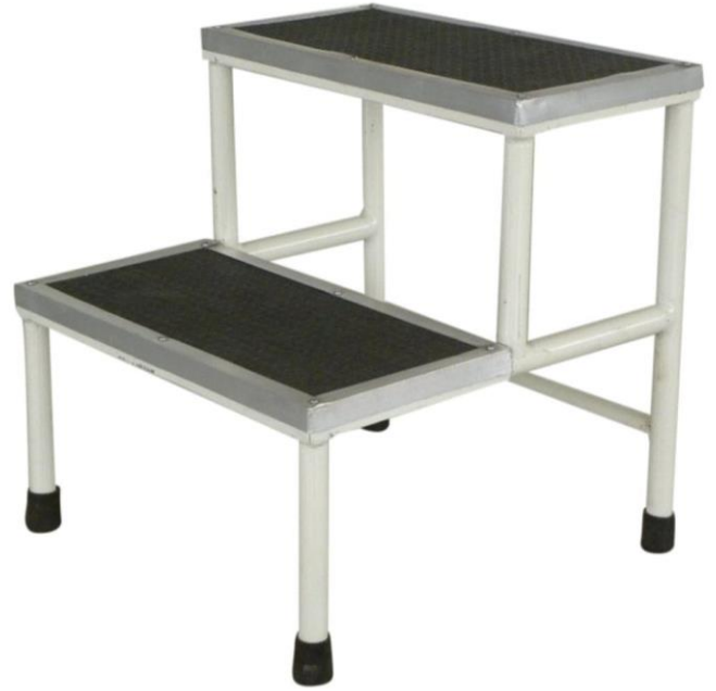
Foot Stool – 2 Steps