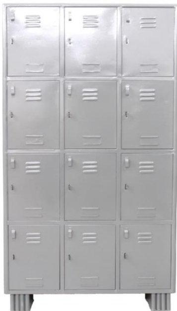
Pigeon Hole Locker