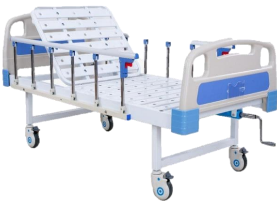
Fowler Bed – Single Function