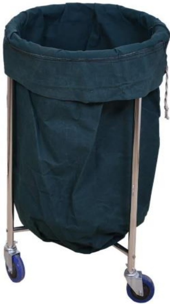
Solid Line Trolley - Single

Your One-Stop Solution, Everything Your Hospital Requires GST NO: 33ATMPP2166R1ZY