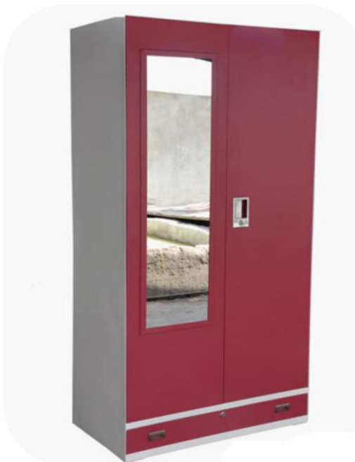
Steel Almirah - Big