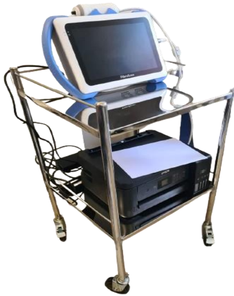
Three Shelf ECG Trolley