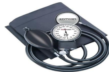
Dial Type BP Apparatus