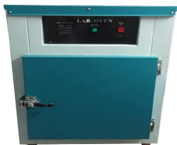
Hot Air Ovan