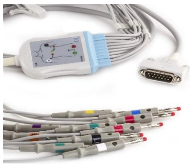
10 Lead ECG Cable