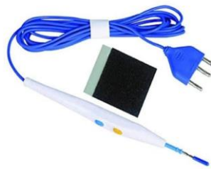
Pencil with Tip Cleaner