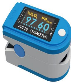
Finger Tip Pulse Oximeter