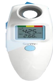
PFT Machine/ Spirometer