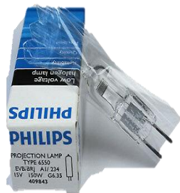
Halogen Bulb without Cup