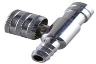
Valve - Diamond BP Apparatus