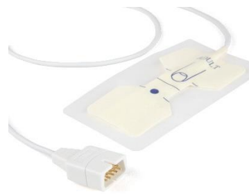
Disposable SPO2 Probe