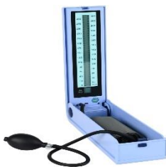
Diamond BP Apparatus