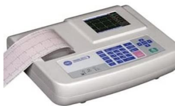
3 Channel ECG Machine