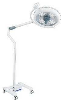
Portable OT Light