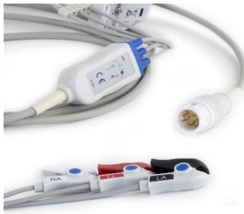
3 Lead ECG Cable