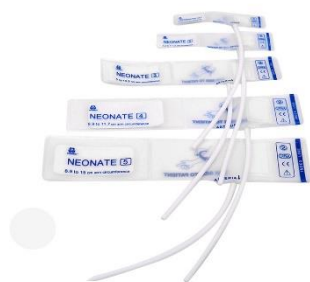
Disposable NIBP Cuff