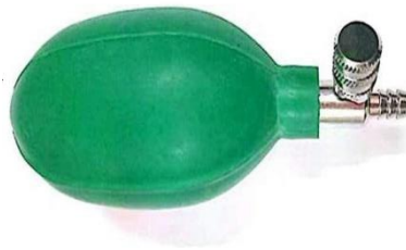
Bulb with valve Diamond BP Apparatus