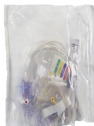
Edwards Dual IBP Transducer Kit