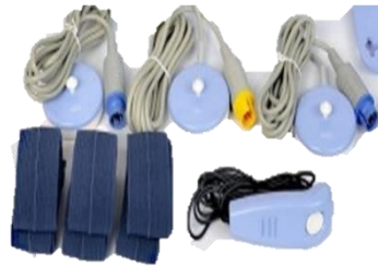
Fetal Monitor Cable