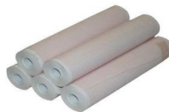
ECG Paper For all types