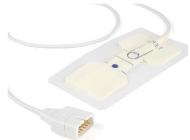
Disposable SPO2 Probe