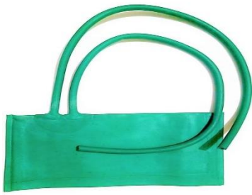
Bladder - Diamond BP Apparatus