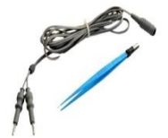
Bipolar Forceps With Cable