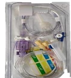
Edwards Single IBP Transducer Kit