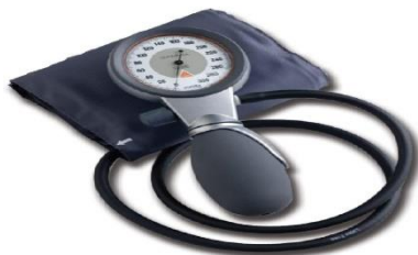
Hand Held BP Apparatus