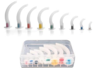
Surgical Airway Path