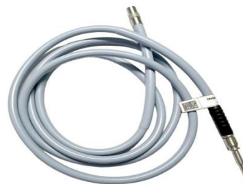
Fiber Optic Cable