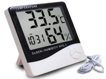
Digital Thermo Hygrometer