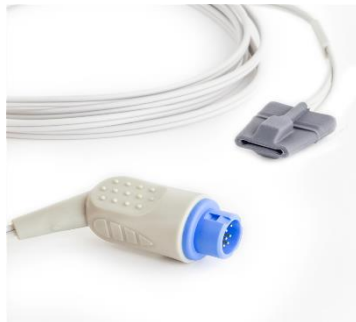
Pediatric SPO2 Probe