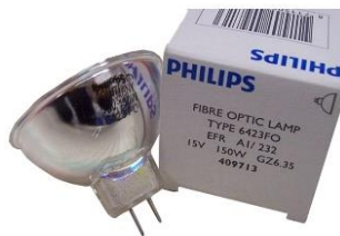
Halogen Bulb with Cup