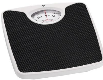
Analog Weight Machine