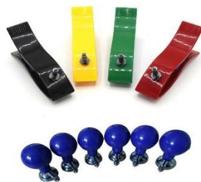
ECG Clamp & Bulb Electrodes