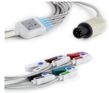
5 Lead ECG Cable