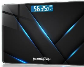
Digital Weight Machine