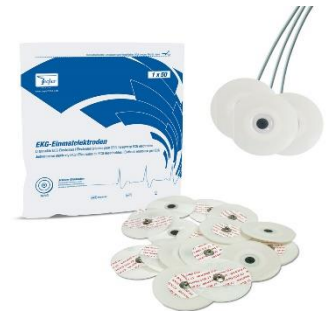
Disposable ECG Electrodes