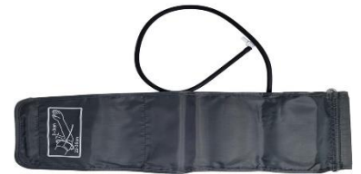
Cuff - Digital BP Apparatus