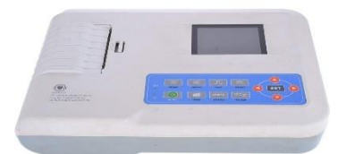
Single Channel ECG Machine