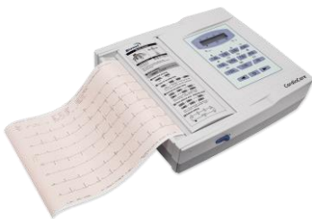
12 Channel ECG Machine