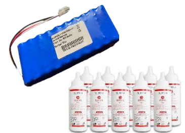
ECG Battery & Gel For all types