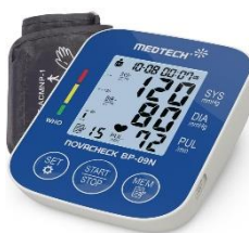
Digital BP Apparatus