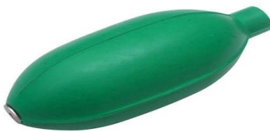
Bulb - Diamond BP Apparatus