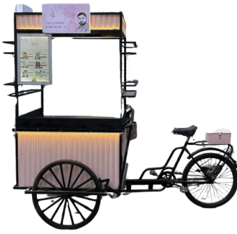
TRICYCLE CART (3*4) FT