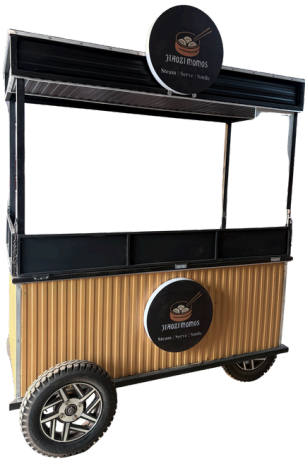
MOMOS CART (3*6) FT