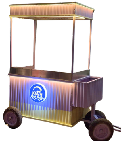
SMALL FOOD CART (2.5*4) FT