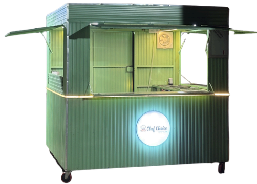
KIOSK (8*8) FT