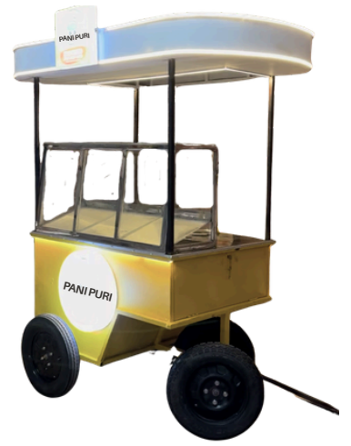
PANI PURI CART WITH SS GLASS COUNTER(3*4) FT