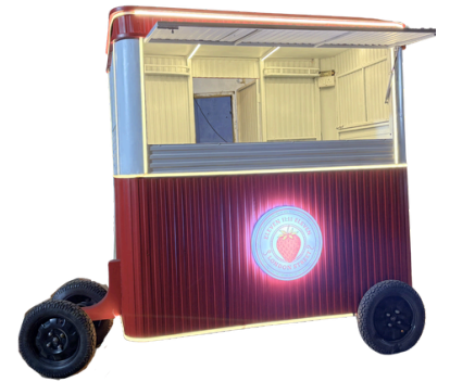
FOOD TRAILER (4*6) FT