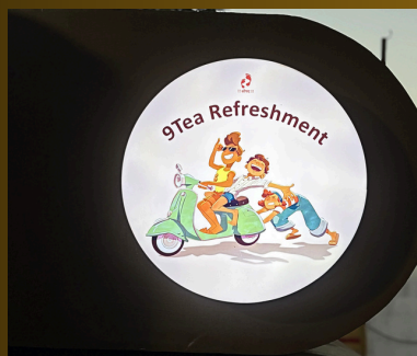
LED LOGO & MENU (2PCS) EACH