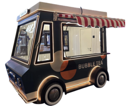
ELECTRIC FOOD CART (4*8) FT