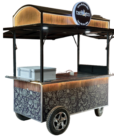
CART WITH 4 SIDE FLAPS(3*6) FT