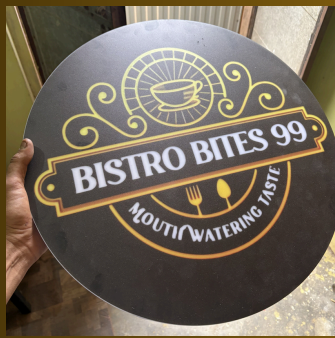
LED LOGO & MENU