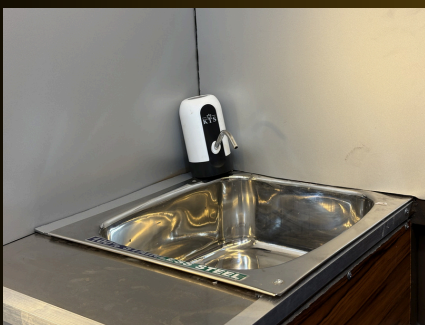
SINK & WATER TANK