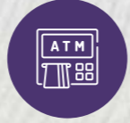
PROVISION FOR ATM