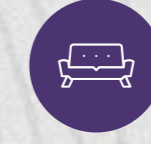
SENIOR CITIZEN SEATING ZONE