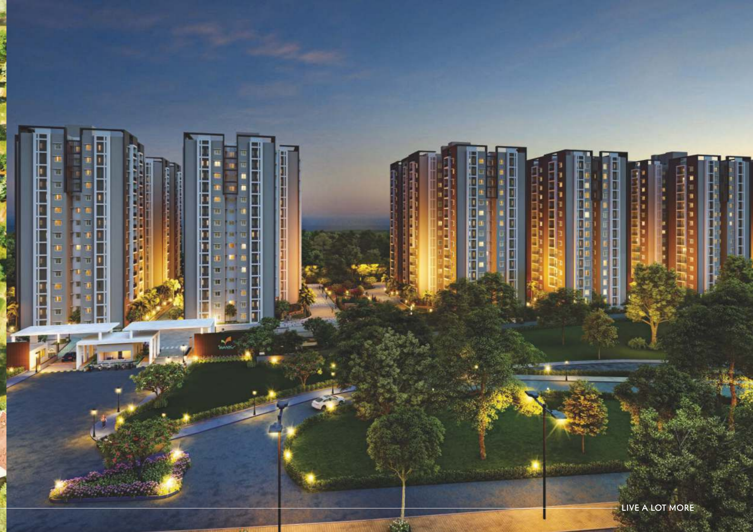
LIVE A LOT MORE