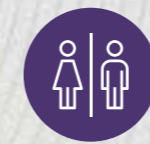
DRIVERS AND MAIDS TOILETS