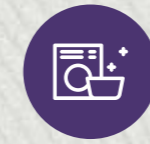
PROVISION FOR LAUNDRY FACILITY