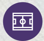
MINI SOCCER / PLAY LAWN