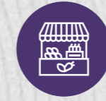
PROVISION FOR VEGETABLE MARKET ON SUNDAYS