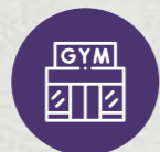
AIR CONDITIONED GYM