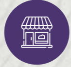
PROVISION FOR CONVENIENCE STORE