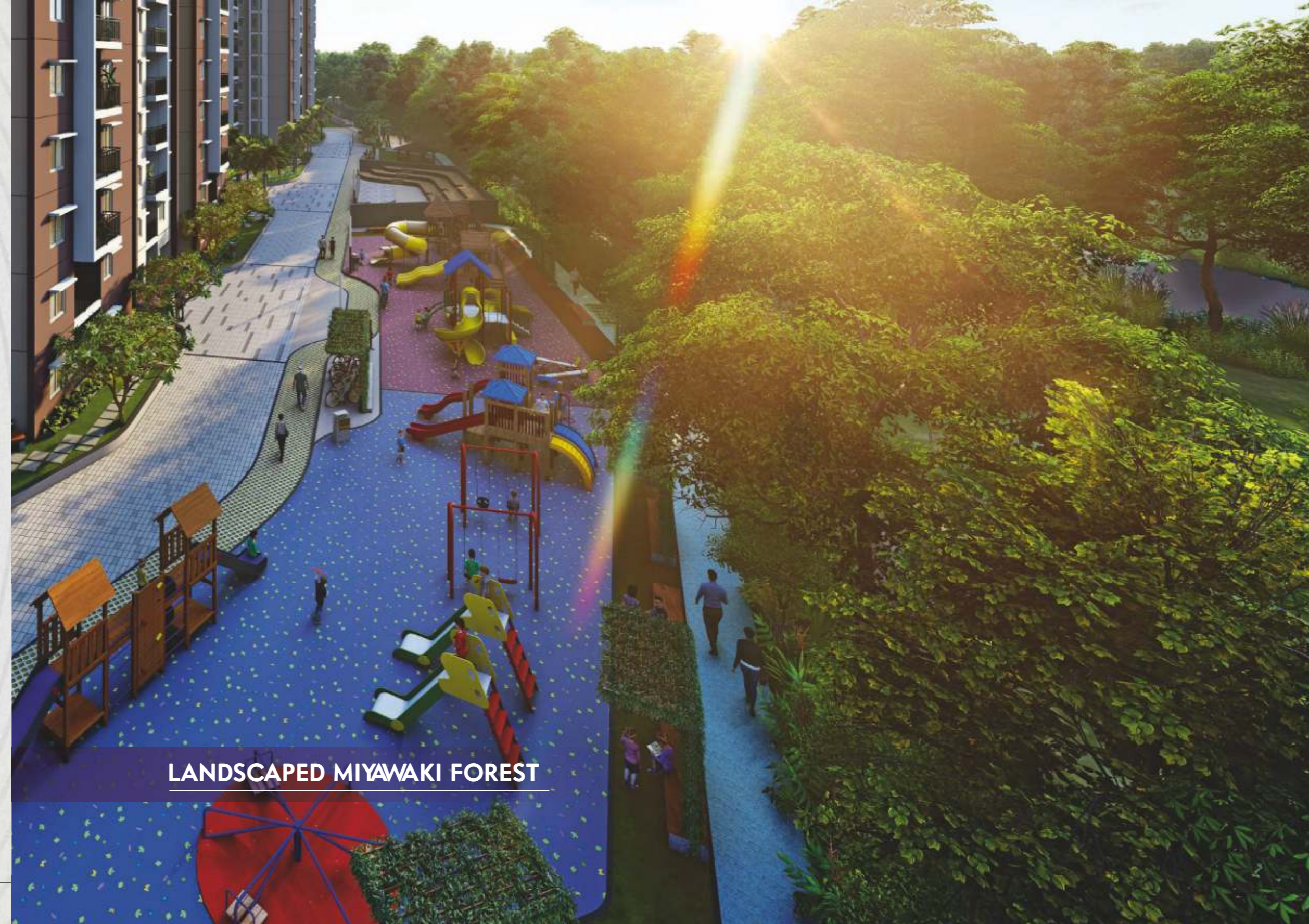
LANDSCAPED MIYAWAKI FOREST

One of the most unique features of Symphony is the Miyawaki Forest that is part of our property. Miyawaki Forests are a Japanese method of creating dense vegetation in an area. It's like an urban forest of sorts. By creating this, we're ensuring that the residents of Ramky One Symphony always get the fresh air they deserve.