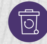
GARBAGE COLLECTION THROUGH GARBAGE CHUTES