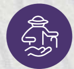
SENIOR CITIZEN ACTIVITY ZONE