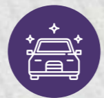
PROVISION FOR CAR WASH