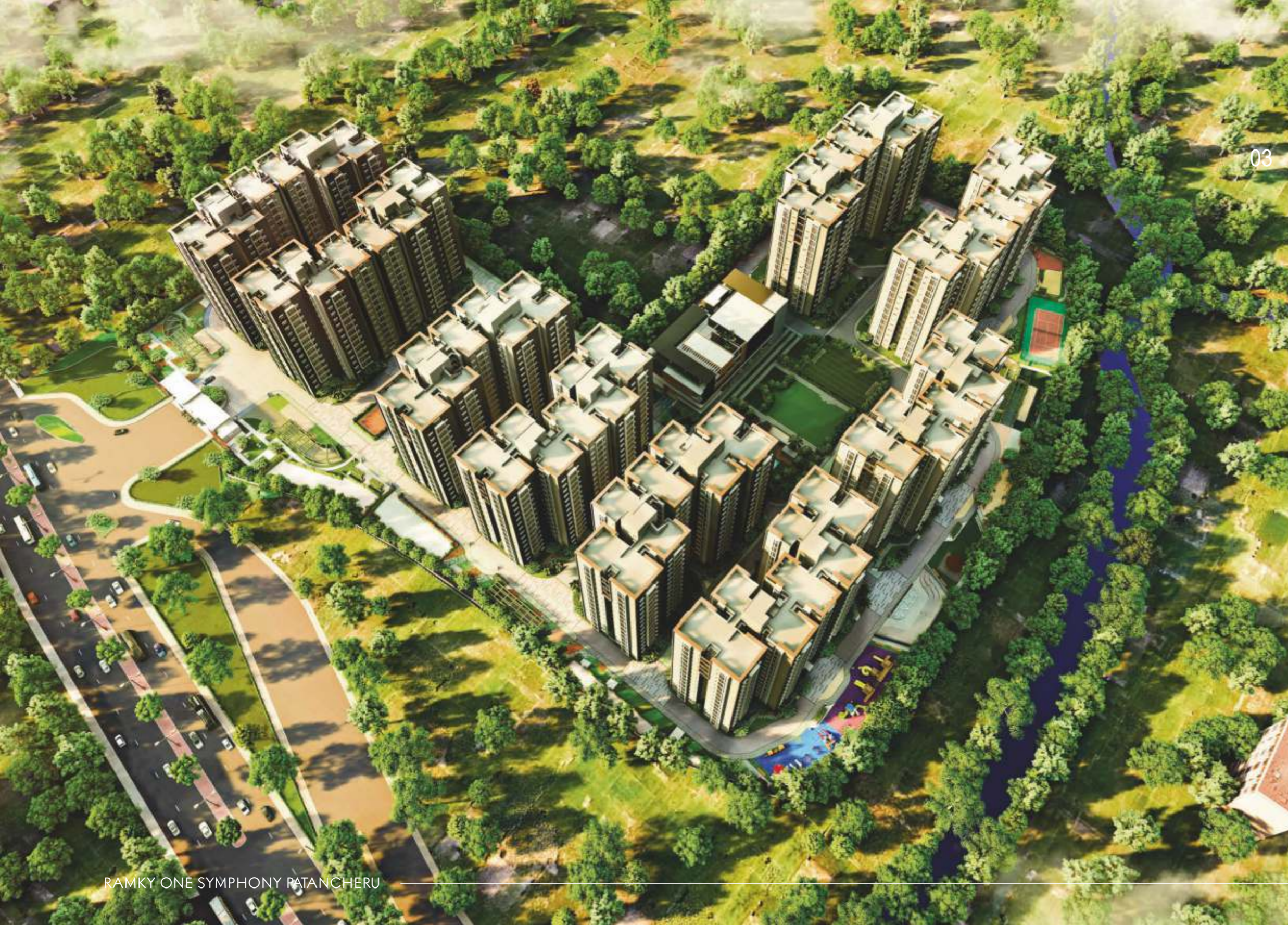
RAMKY ONE SYMPHONY PATANCHERU