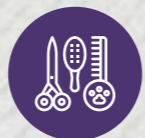
PROVISION FOR SPA/SALON