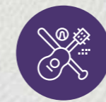
ACTIVITY ZONES IN ENTRANCE LOBBIES