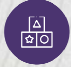
PROVISION FOR CRÈCHE