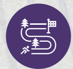
WALKING & JOGGING TRACK