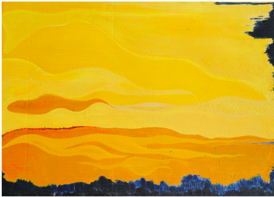
Dunes of my Soul. Acrylics on cardboard, 100 by 62 cm

A R T I N S P I R E D B Y N A T U R E 2025-2026