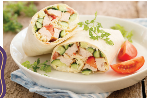
Depth of Field