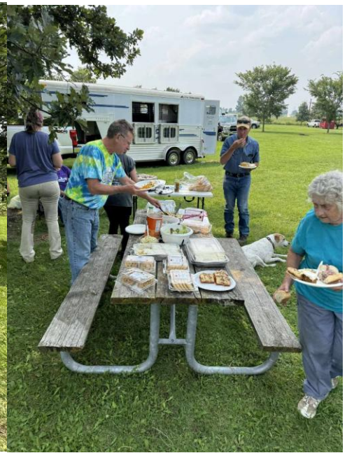
8/9 Associates Play Day (6 brave participants and their trusty steeds 🐾)