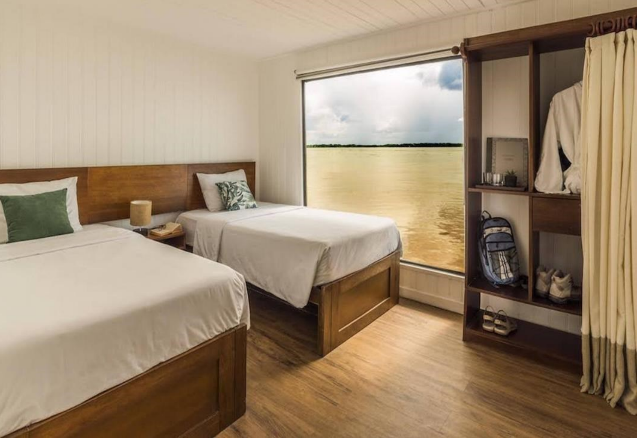
La Perla –Standard Cabin