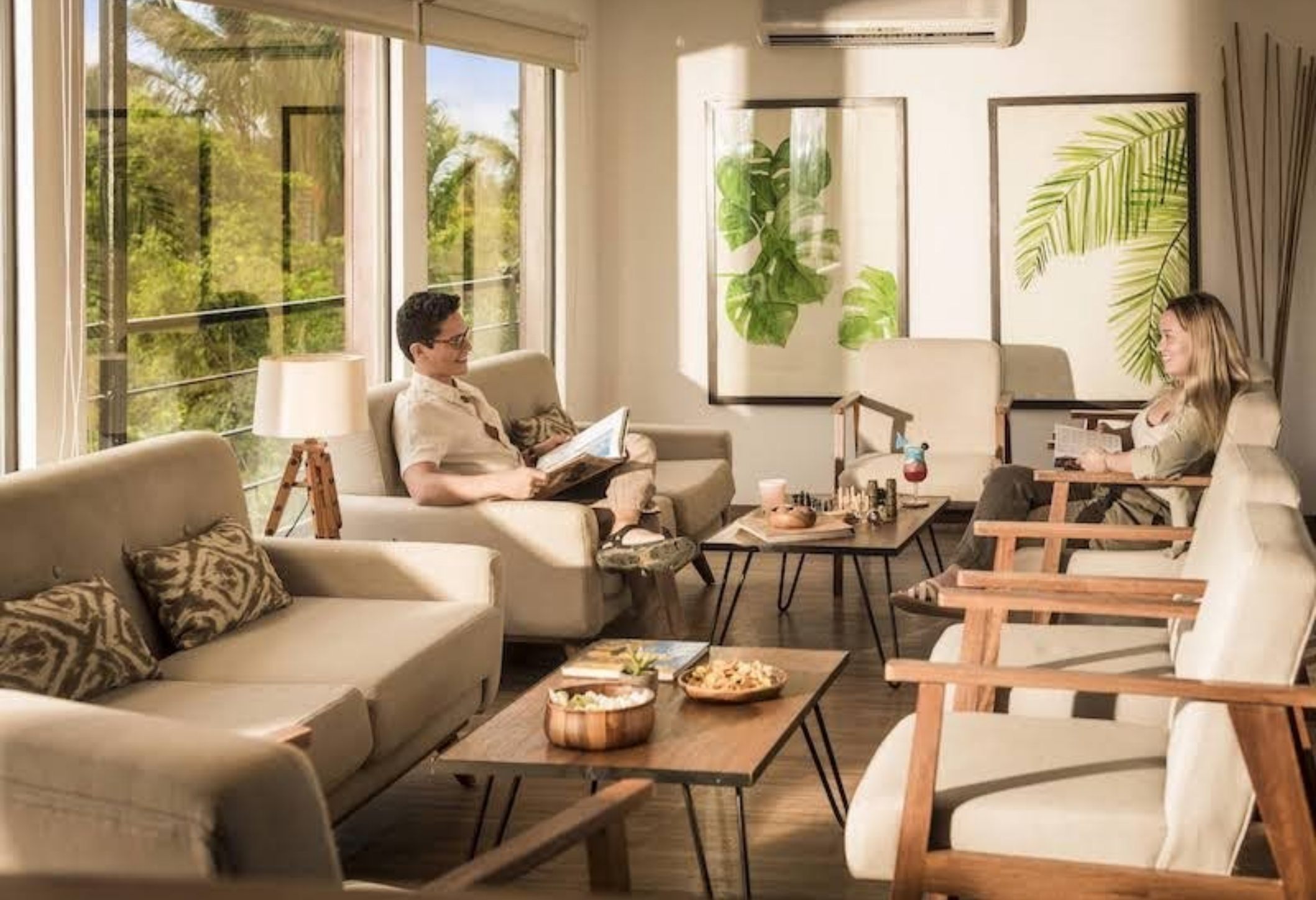
La Perla- Lounge interior