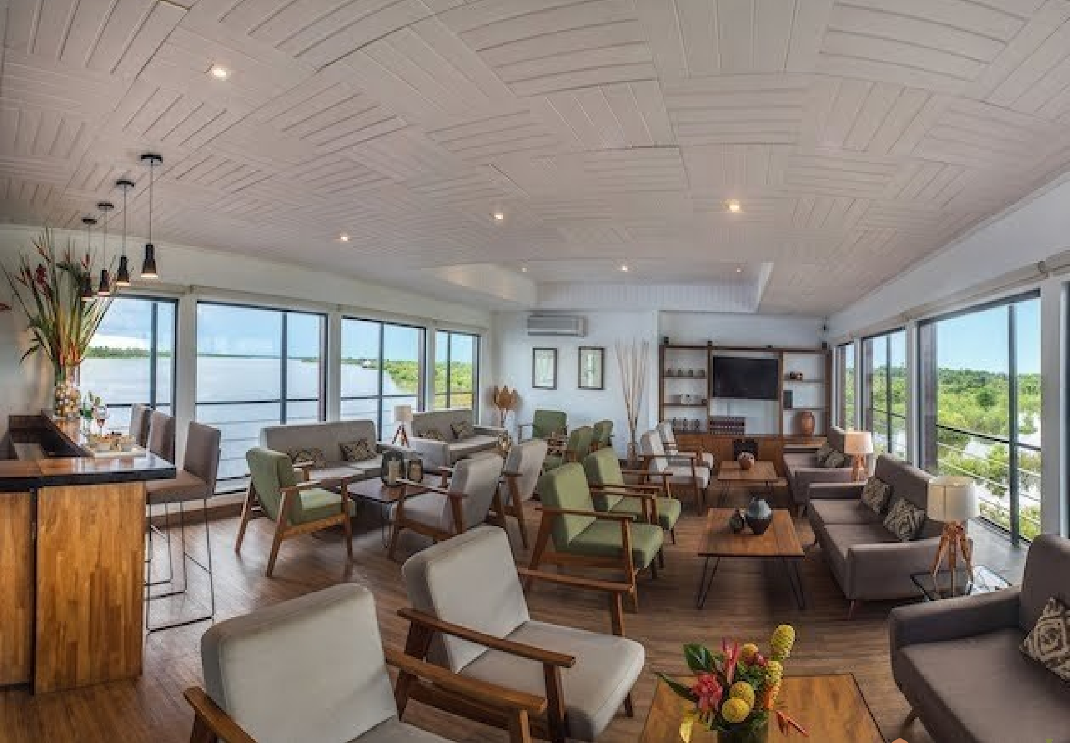
La Perla- Lounge & Bar