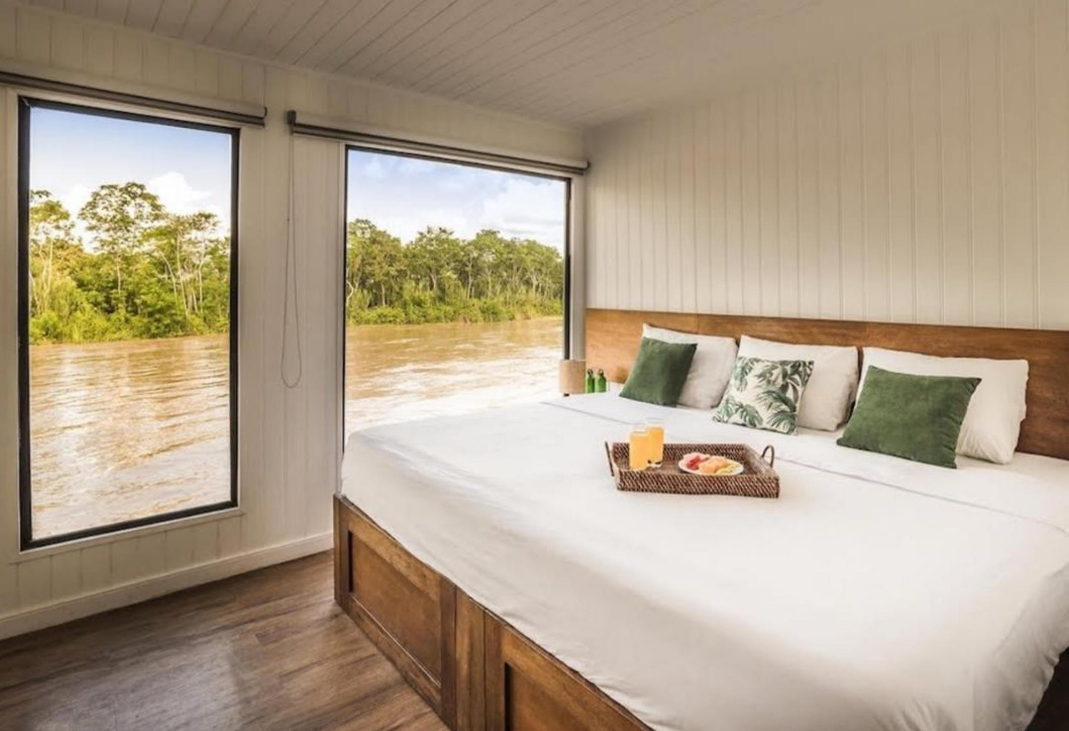
La Perla –Standard Cabin