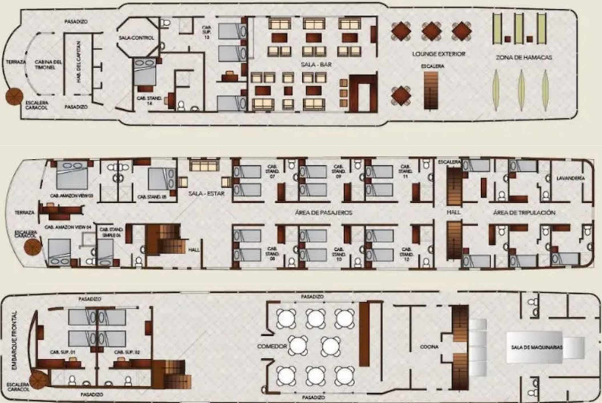
La Perla – Deck Plan