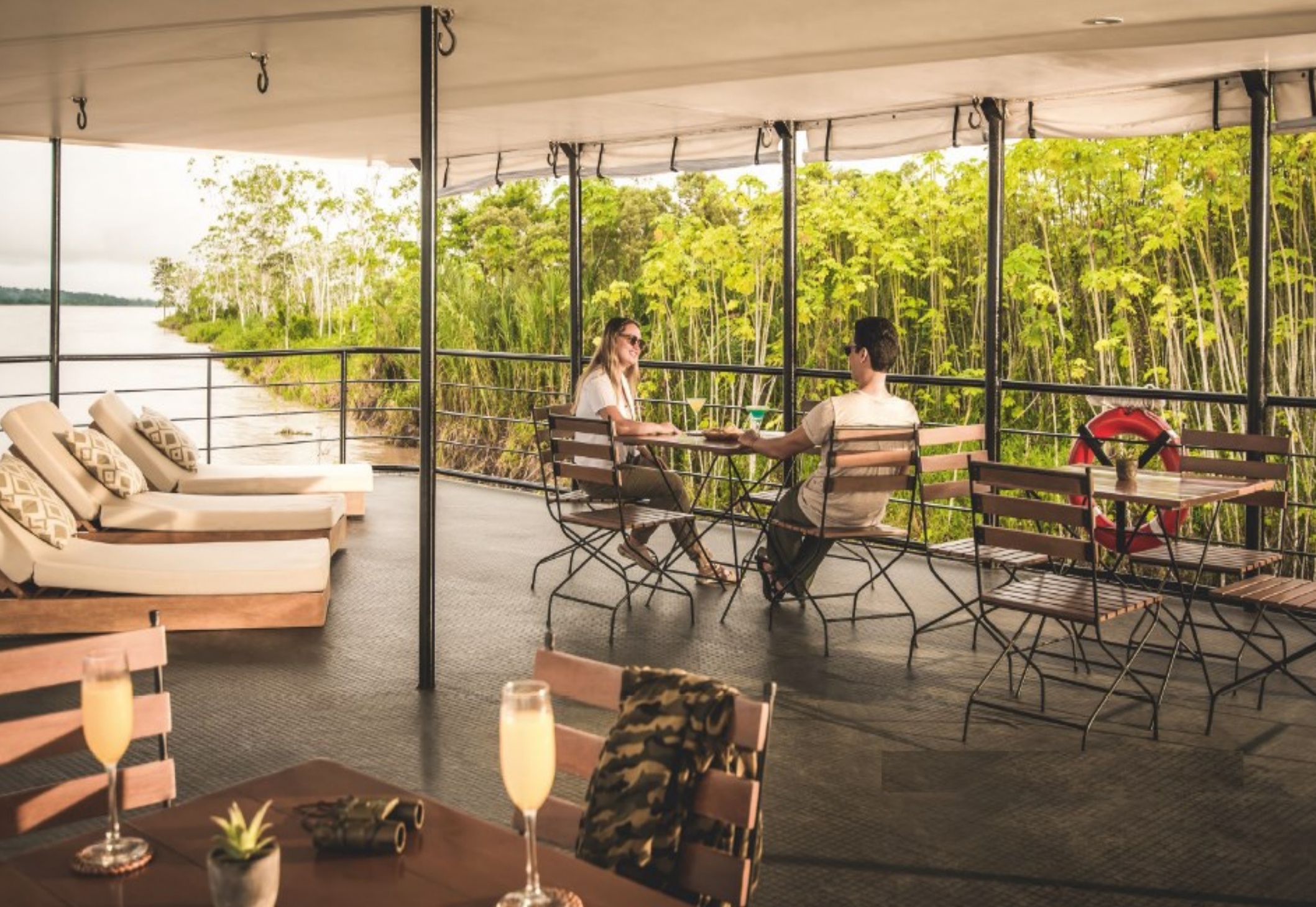
La Perla – Observation Deck