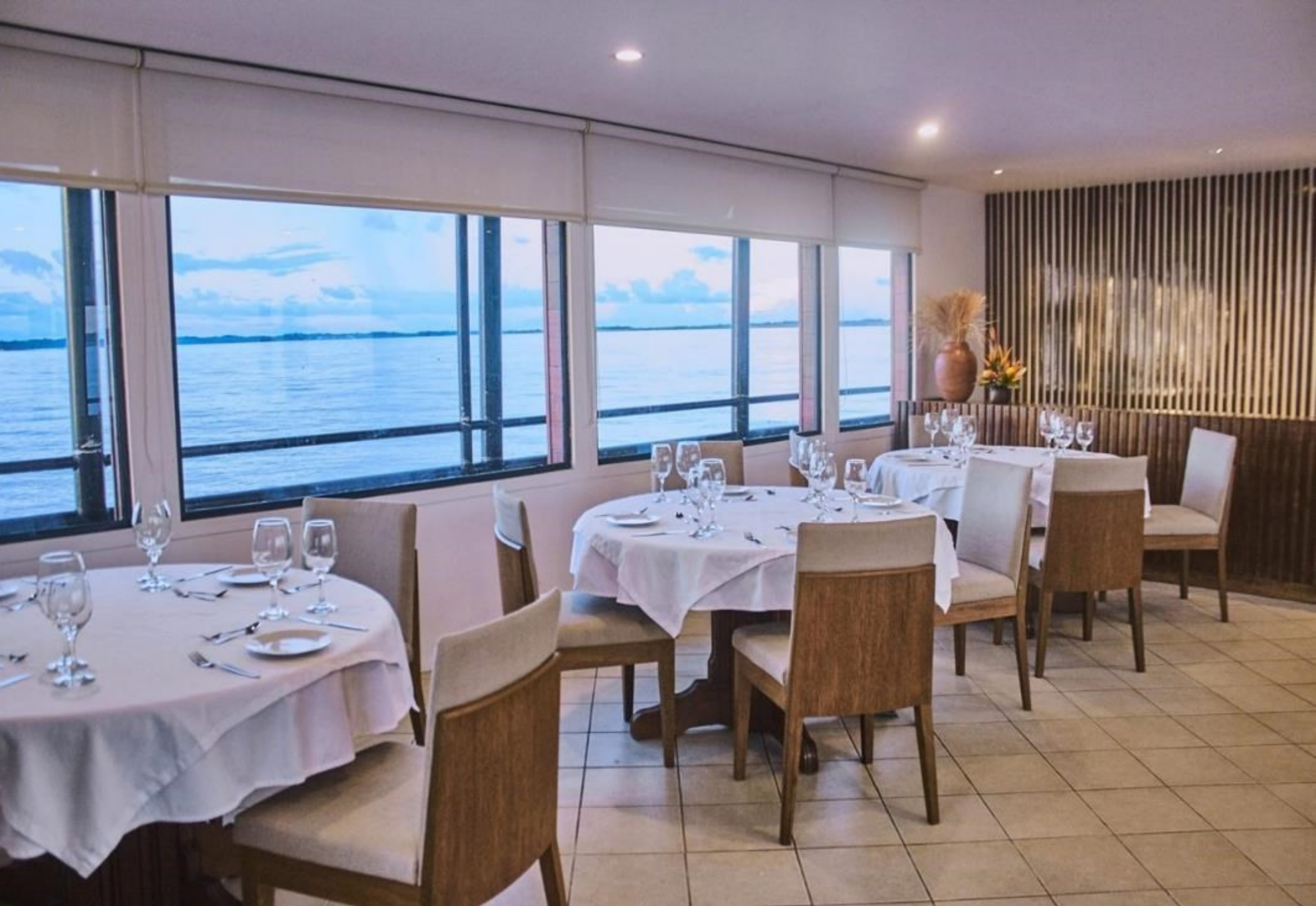
La Perla – Dining Room