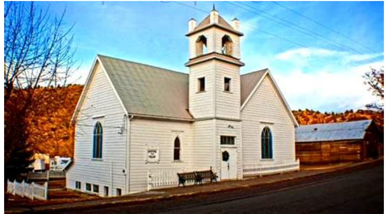
Mitchell First Baptist Church