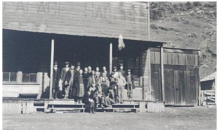
Mitchell's First High School was held in the Palace Saloon