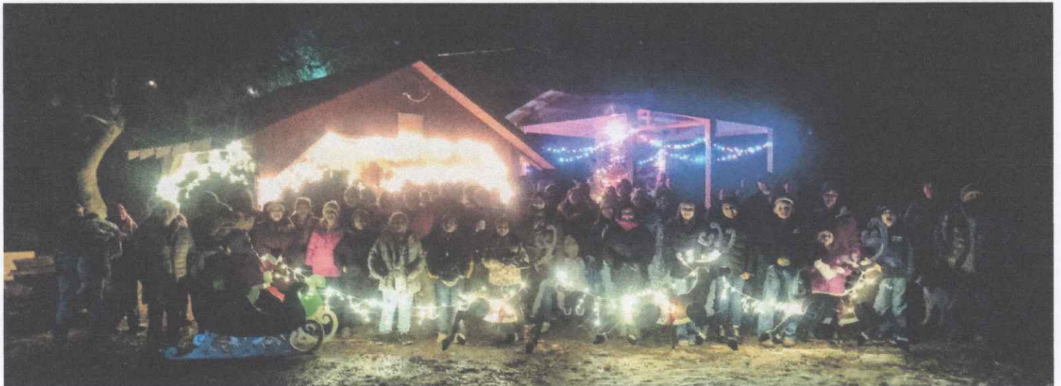
Mitchell Christmas Tree Lighting December 11, 2022