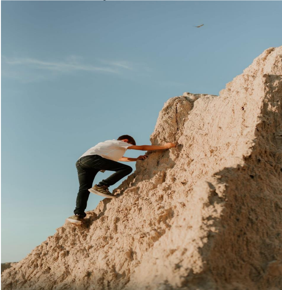
Rapid City First United Methodist Church 629 Kansas City St. Rapid City, SD 57701