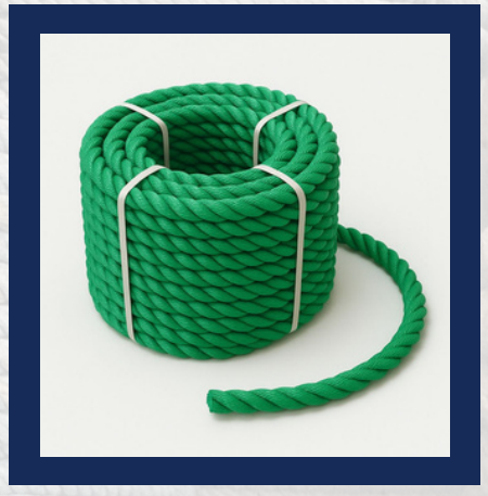
Polypropylene (PP) Nylon Rope