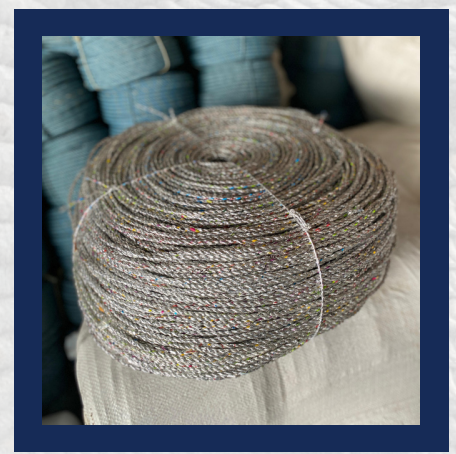
Polypropylene (PP) Rope/ Tarpaulin Edge Rope