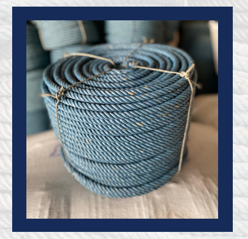
Polypropylene (PP) Rope