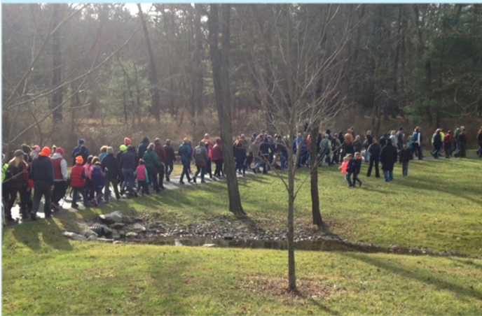
A couple of hundred friends heading off on the First Day Hike

The First Day Hike on January 1 is growing in popularity throughout the country. America's State Parks First Day Hikes is a national initiative in all fifty states that began in 2012, and each year more parks and individuals participate. According to DCNR, nearly 3,000 hikers (and 134 dogs!) got a jump start on their New Year's resolutions, exercising and connecting with nature on First Day Hikes at 31 Pennsylvania state parks. Hikers trekked about 7,755 miles combined...more than three times the length of the Appalachian Trail, which runs from Maine to Georgia.