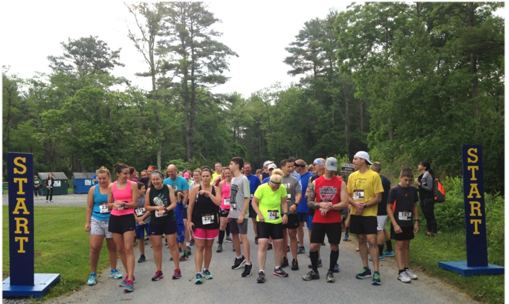
Ready, set...eager runners await the start of the Charcoal Challenge 5K

This event is hosted by the Friends of Pine Grove Furnace State Park, and all proceeds support our wonderful park. If you are interested in volunteering to help with the water stations or course markings, email us at pgfvolunteers@gmail.com .