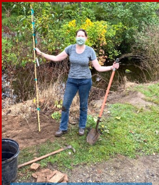
Planting trees on National Public Lands Day

Even with all of the uncertainty and the changing COVID-19 rules, volunteers were able to donate 1,358 hours to the Park.