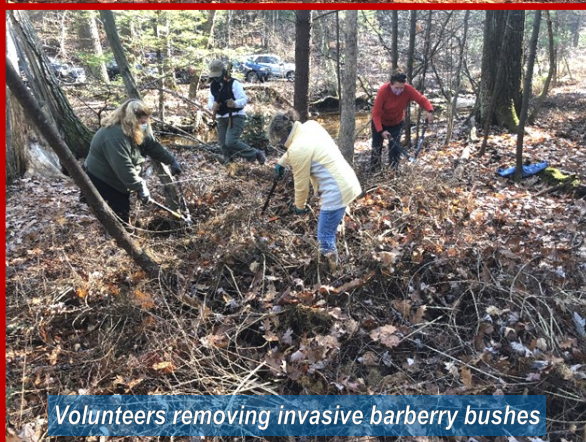
Volunteers removing invasive barberry bushes