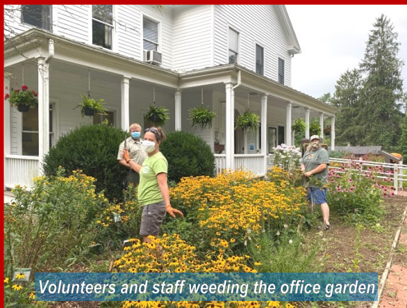
Volunteers and staff weeding the office garden