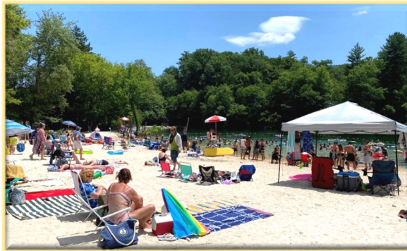
A busy Fuller Lake on the Fourth of July 2020

Even though the Campground was closed in the spring and most of the organized educational and recreational activities were cancelled, park visitation increased dramatically in 2020. Pine Grove Furnace had more than 379,000 visits last year, a 29 percent increase compared to 2019. According to DCNR, statewide park attendance increased from 37 million in 2019 to more than 46.9 million in 2020, a 26.6 percent increase.