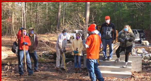
Volunteers preparing to work on the Koppenhaver Trail