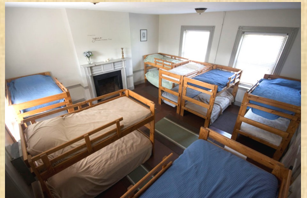
Dorm room in the Ironmaster's Mansion as shown on the Appalachian Trail Museum website