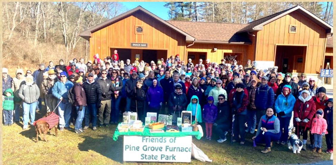
An enthusiastic group of 163 First Day hikers and their 13 dogs are all smiles as they begin the new year walking the trails in Pine Grove Furnace State Park