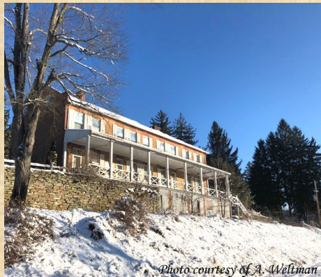
The Ironmaster's Mansion in Pine Grove Furnace State Park