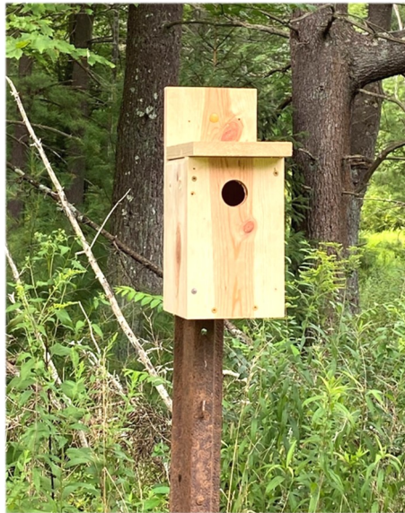
One of ten bluebird boxes that was recently installed at Pine Grove Furnace State Park

Certain birds that nest in cavities of trees or old fence posts have seen their nesting opportunities decline due to changing landscapes and competition from non-native birds.