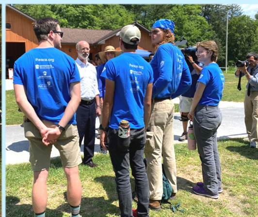
The governor had the opportunity to meet with members of the Pennsylvania Outdoor Corps