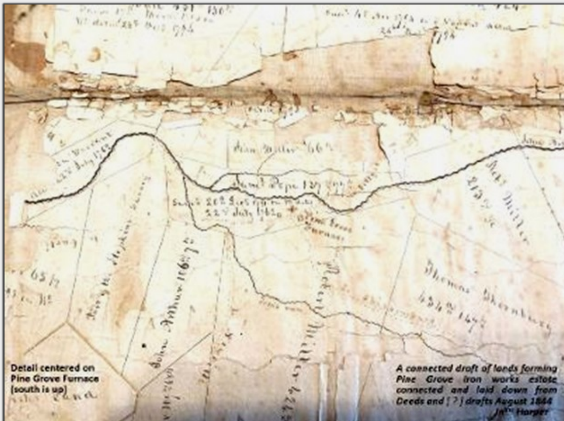
Detail centered on Pine Grove Furnace (south is up)