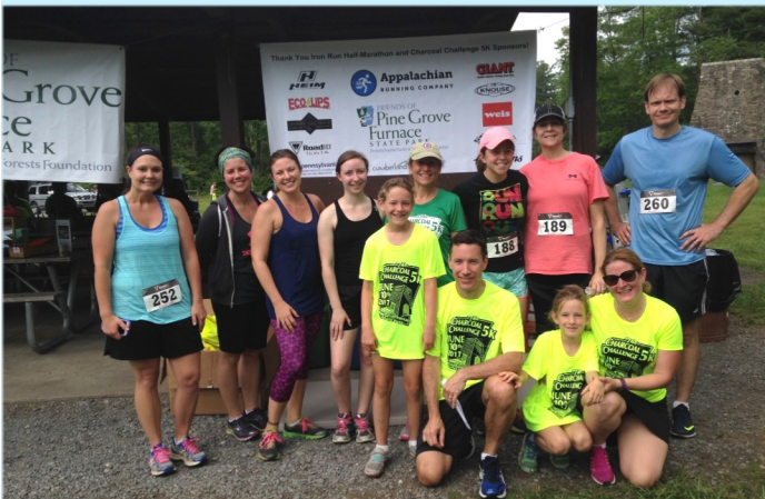
Excited runners gather in front of the sponsors banner

This is an annual fundraiser of the Friends of Pine Grove Furnace—all proceeds benefit the park. This year's event raised almost $5,500 (net) for park programs and improvements. Thanks everyone! We hope to see you for the next races on June 9, 2018.