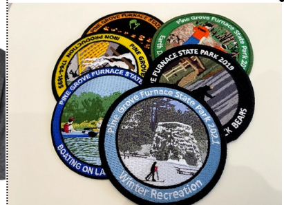
Collect our annual Park patches ($5)