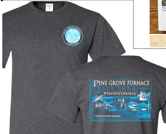
Assorted t-shirts, fleeces, and sweatshirts are available