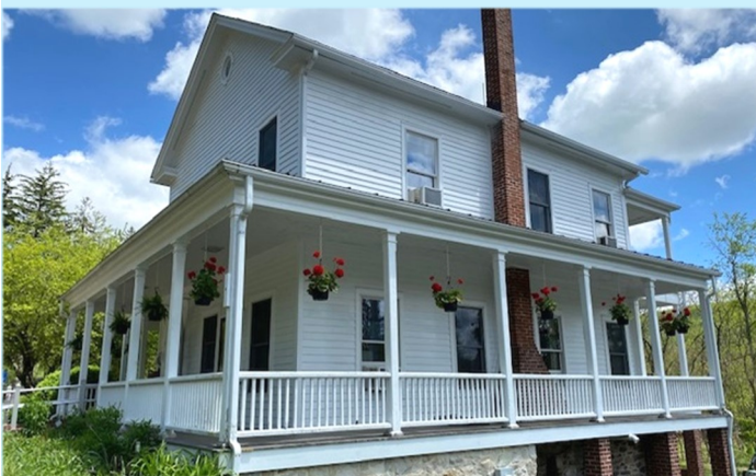
Hanging baskets beautify the wraparound porch at the park office