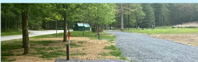
Notice above that there are convenient water spigots along the new entrance to the Family Campground

near Laurel Lake. Meanwhile, the expanded entrance/exit to the campground will become a reality this summer due to the combined efforts of park staff and the Friends. The park staff finished site preparation this spring, and the Friends will be paying for surfacing the new entranceway.