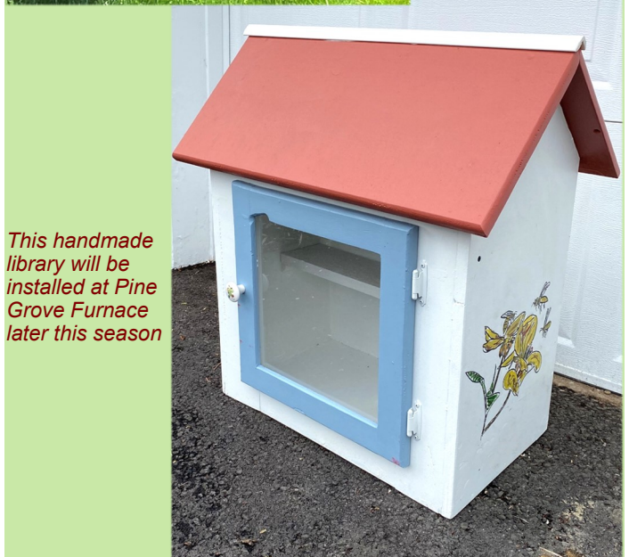
This handmade library will be installed at Pine Grove Furnace later this season