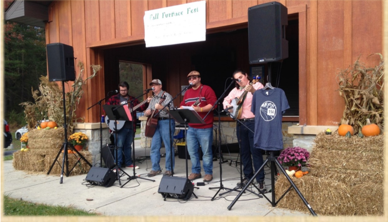
Junction 114 was one of five bands at Fall Fest