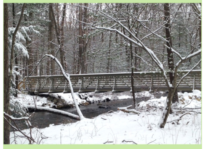
Mountain Creek Trail Bridge built by the Friends in 2016

The new bridge near Old Railroad Bed Road complements a bridge along Mountain Creek Trail that the Friends group paid for and installed in 2016.