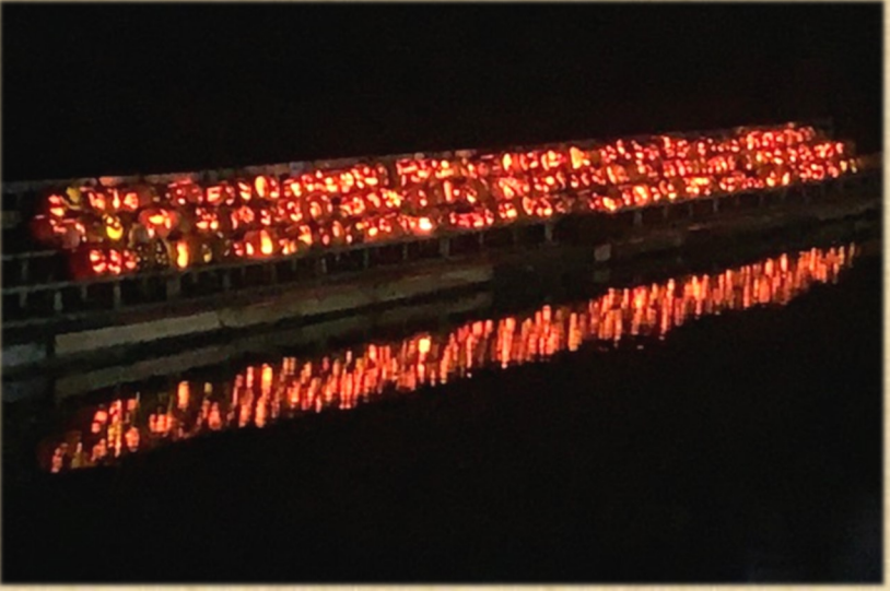
The pumpkin float is ready for the telling of the Legend of the Hairy Hand