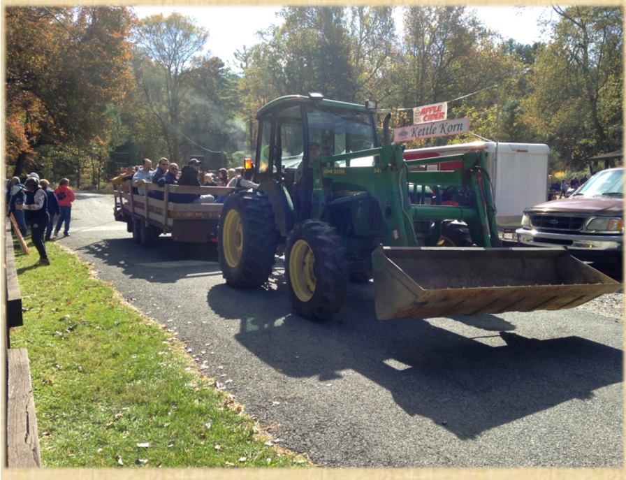
Here comes the ever popular hayride back from another loop in the Park