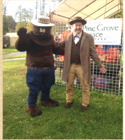
Smokey Bear is always a crowd pleaser