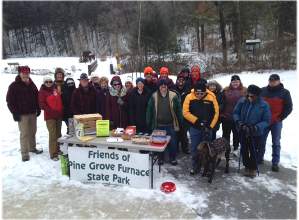
January 1, 2018 – bundled up hikers gathered at Fuller Lake for the 2018 hike

Meet at Fuller Lake Bath House at 1 p.m. on January 1, 2019. See you there!