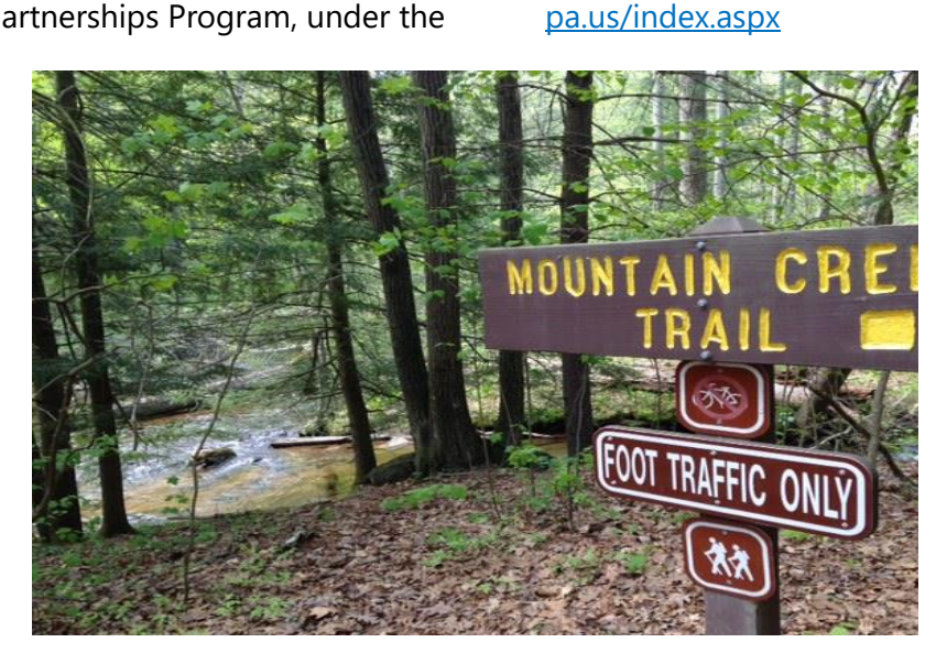
Trail head to Mountain Creek Trail at end of Ice House Road near Laurel Lake.

Dept. of Conservation and Natural Resources. Once completed, the improved 1.72 mile trail and fiftyfoot bridge will provide an easy hike between the Laurel Lake and Fuller Lake areas of the park. We will need volunteers to clear away a number of large fallen trees and replace old crossings over boggy areas on the trail. Volunteers are expected to begin work on the project this spring on Earth Day, April 23. If you are interested in volunteering, sign up as a conservation volunteer for Earth Day at the DCNR website: https://www.volunteers.dcnr.state.