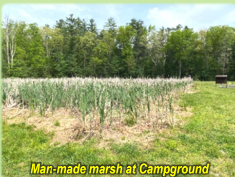
Man-made marsh at Campground

You may have noticed cattails growing in the large grassy field just inside the Family Campground entrance along Bendersville Road. This marsh is a "Constructed Treatment Wetland" built in 2007. An integral part of the park's wastewater treatment system, a constructed wetland uses natural processes to purify the effluent that flows into it. A similarly constructed wetland was installed near the Laurel Lake bathrooms, too.