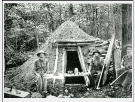
A collier hut

They said it was a sign of experience to be covered in charcoal dust, and would not wash themselves all summer long! Their huts and food became filthy as well. It was rough work, but the colliers were well paid for every bushel of charcoal they produced.