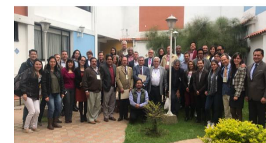
Workshop in Bogota (June, 20-21, 2018) Universidad Nacional de Colombia