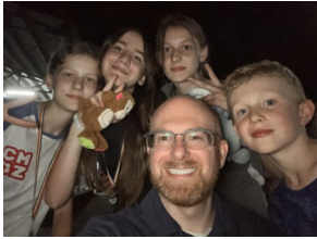
Kids at camp

As the hymn states, "To God be the glory... great things He hath done," so rings out our voices to God. The last three months have been such a blessing and encouragement to us. Rejoice with us in the Lord's working.