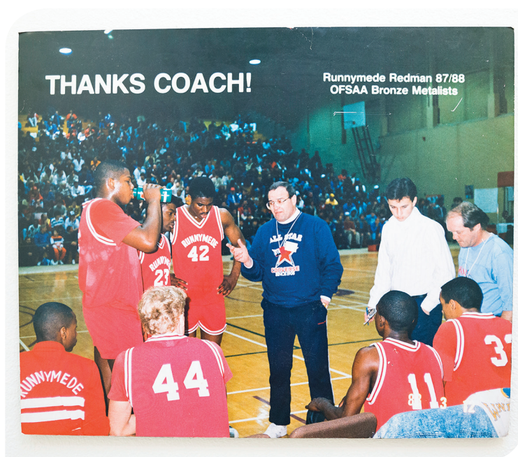
Coach P in action.