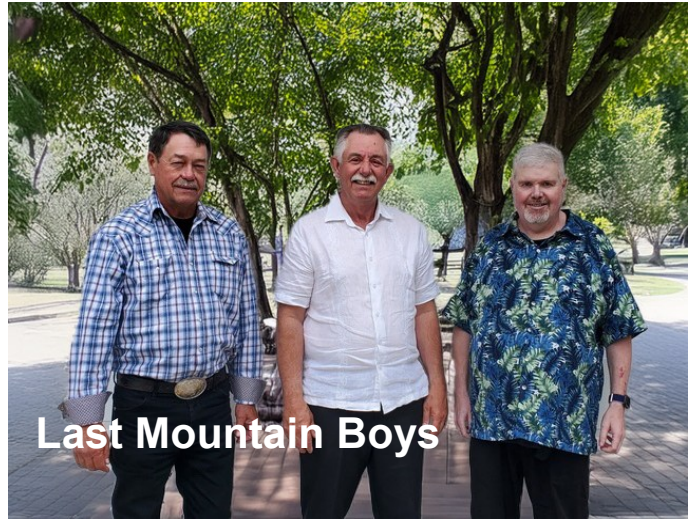
Last Mountain Boys