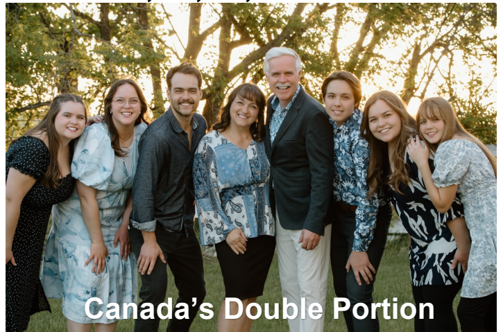
Canada's Double Portion

Bringing You Twenty Five Years Of Gospel Music