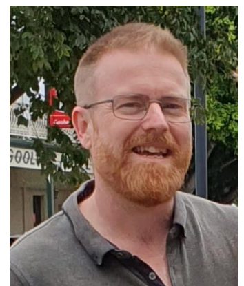
OUR VICE CHAIRPERSON