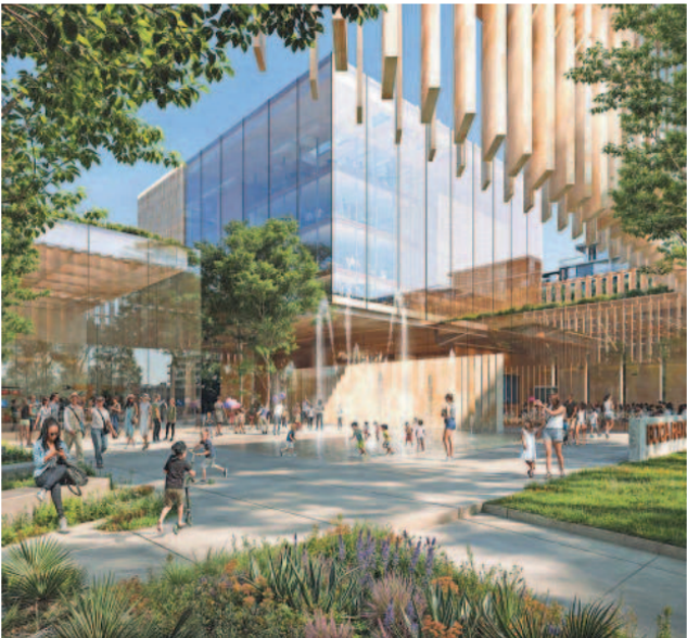
Boca Raton City Center will feature pedestrian-oriented streets, low-rise and mid-rise building heights and architectural elements that will integrate with the surrounding neighborhood.