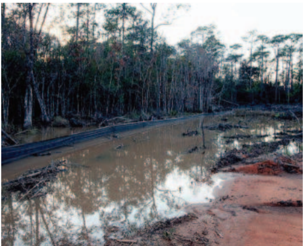
Water pools on the construction site along Furlong Drive in Milton on Nov. 27, 2024. Santa Rosa County is asking for restitution to recoup its costs for remediating environmental harm developers caused in the area.