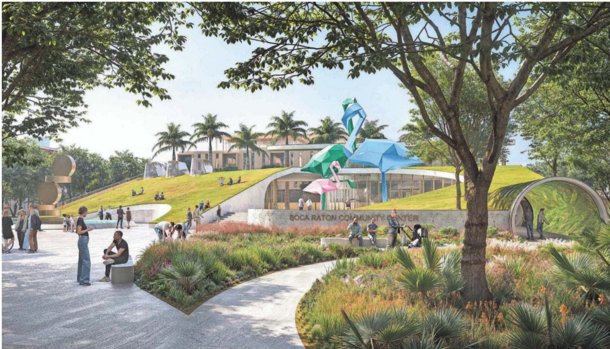
The new Boca City Center aims to include several sustainable elements, including dense tree canopies to reduce urban heat, pedestrian accessibility and stormwater management while integrating green and gray infrastructure with 10- to 15-minute walking paths.