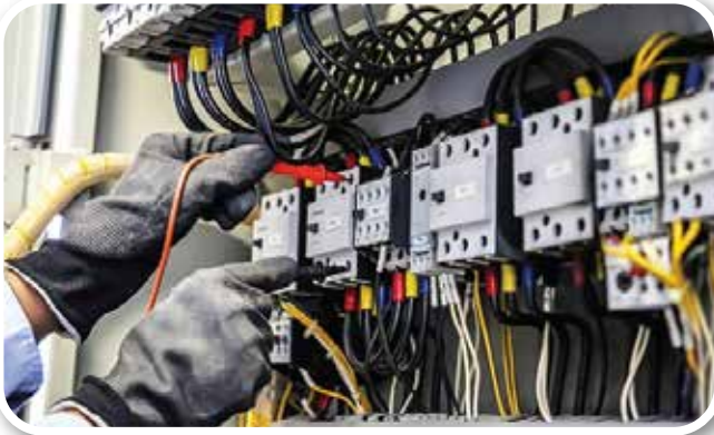
Electrical, telecom, and road lighting networks