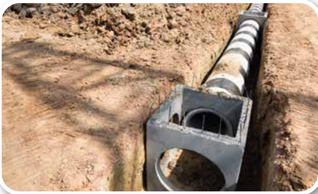
Stormwater and rainwater drainage systems