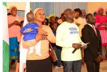
Founders of SECHILD leading the awareness creation