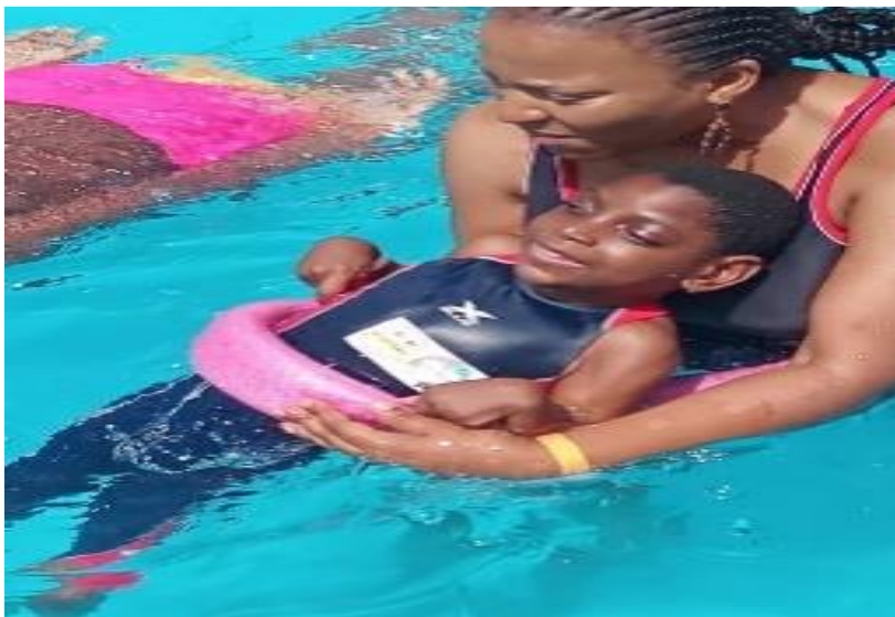
Therapist supporting our hero @ Aquatic therapy session

Aquatherapy was organised for 30 children with Cerebral Palsy, under the supervision of trained and certified professional therapists. The therapy provides