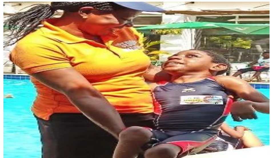
Care givers at the aquatic therapy

deep, intense exercise as well as physical functioning with the aid of water's restorative and detoxifying properties. water therapy is beneficial to hydrating, oxygenating and revitalizing the body's musculoskeletal system. Gravitational pull is released, and weightlessness qualities are achieved. Range of movement increases and repetition, stretching and balancing is more sustainable. Additionally, the viscosity of the water provides an excellent source of resistance, which can be incorporated into an aquatic therapy program.