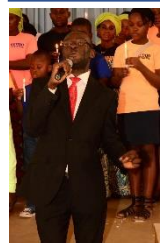
Man Living with Cerebral Palsy leading the awareness creation