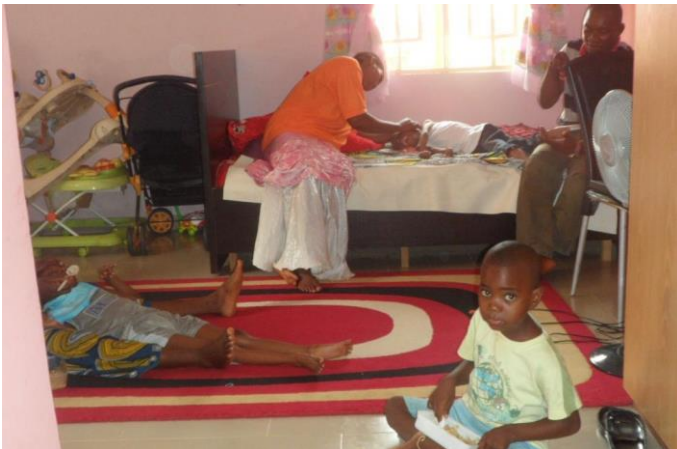
Care givers at the acquatic therapy

We continued to provide residence and therapy for 30 children. Therapy often includes instructions for exercises, stretches, posturing, and balance to be performed outside the therapy sessions, at SECHILD CENTER. physio therapy has several benefits especially for children with cerebral palsy. The primary benefits include helping children overcome physical limitations that significantly interfere with their daily lives.