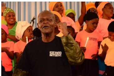
A Parent of a child with Cerebral Palsy leading the advocacy