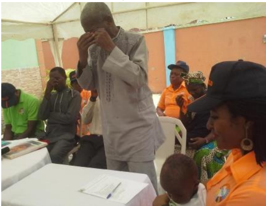
Cross section of parents and givers @ the Dialogue in Social Acceptance of CP