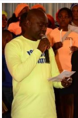
Co-Founder SECHILD at leading the advocacy