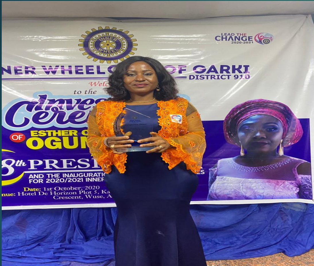
Award for Distinguished Humanitarian Service by Inner Wheel Club Garki