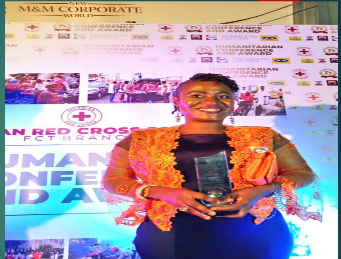
Award for Distinguished Humanitarian Service by International Red Cross