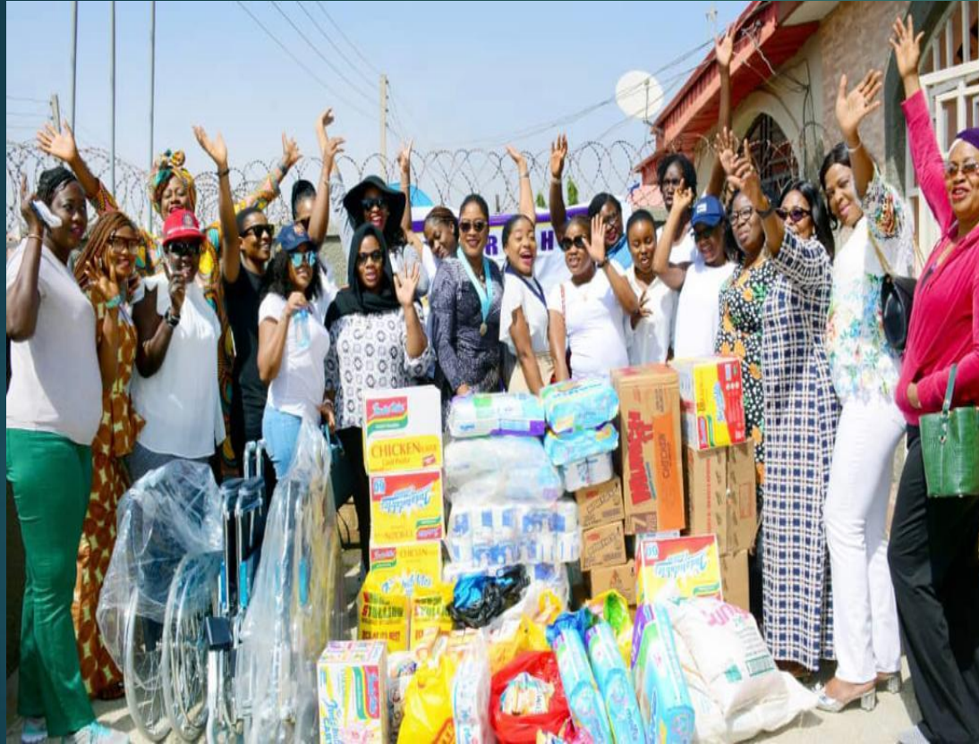
Inner Wheel Club Garki District