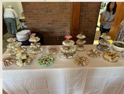
Richmond-Evergreen GC Annual Tea