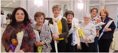
Spring Luncheon 2025-2027 Board