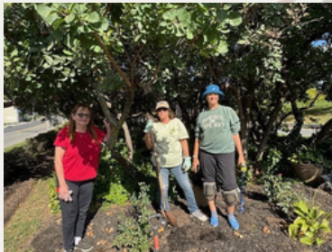
SIGC at The Healing Garden