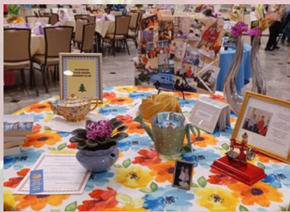
Spring Luncheon REGGC table