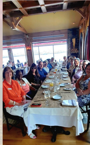
CMGC Spring Lunch at Blue