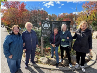
GKGC at Tommy Monaghan Garden