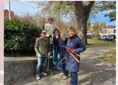
SIGC at Gaeta Park