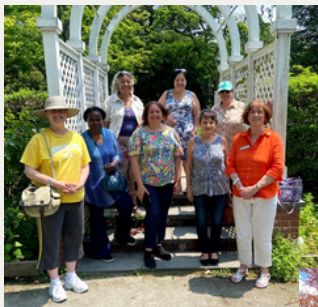
CMGC Snug Harbor