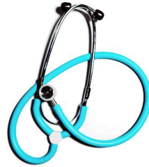
Infant Duoscope Cyan