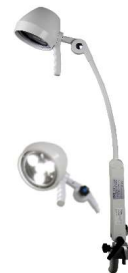
Asian LED Examination Lamp 750.00 398.00

Small and lightweight oximeter that has high-res LCD display for SpO 2 , PR, Pulse Bar, PI and Plethysmogram Recorded data can be uploaded to PC