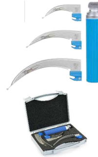
German Economy Conventional Layngoscope Set 320.00 280.00

Economy Laryngoscope Set Comes with a Economy Blue battery handle and 3 Economy Adult Reusable Blades (Mac. 2/3/4) in a hard case