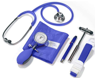
F. Bosch Diagnostic Set Diagnostic set with Stethoscope, Aneroid sphygmomanometer, Classic Tourniquet, Pen Cliplight, Reflex Hammer Buck Available in blue or black