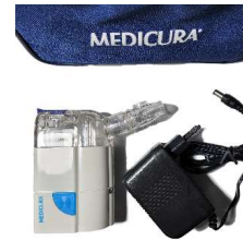
Portable Ultrasonic Nebulizer Smart Set Medicura 5100 with power cable 120.00 88.00 and carry bag, ultrasonic flow rate of 0.7ml/min, up to 4 microns