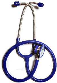
Adult Alto IV Blue