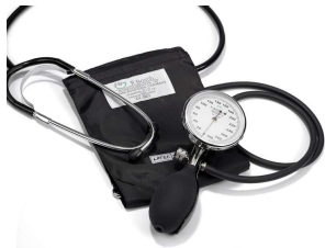
F. Bosch Regent Diagnostic set with stethoscope and large dial aneroid sphygmomanometer Available in black