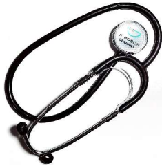
Adult Duoscope Blue or Black