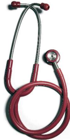
Paediatric Alto II Burgundy