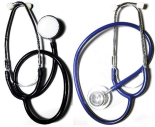
Colorscope Aluminium, dual head Black, Blue