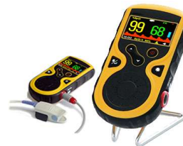
Handheld Pulse Oximeter 490.00 258.00

Small and lightweight oximeter that has high-res LCD display for SpO 2 , PR, Pulse Bar, PI and Plethysmogram Recorded data can be uploaded to PC