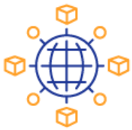
Specialty Courier & Logistics