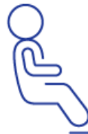
Hazmat- trained Drivers