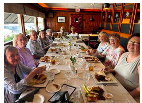
We enjoyed our July board meeting and lunch at Red's Restaurant in Cossackie.