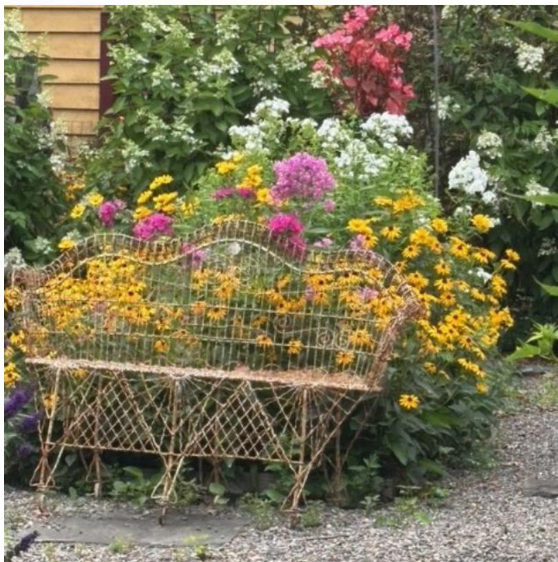
Above and below: Pictures of New Paltz Garden Club members' gardens in the summer.

Hope you all have a happy, restful and safe summer.