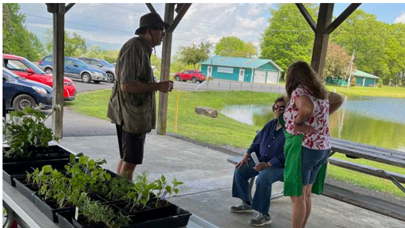
Our Annual Spring Plant Sale is a big fund raiser for the club.