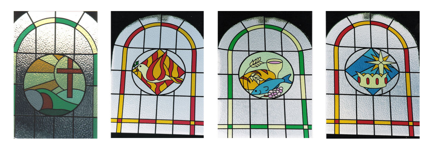
4 of the 5 designs for the new windows based on significant celebrations in the Church calendar: Easter, Pentecost, Harvest & Christmas. Each design appears twice (each on opposing sides of the building). The fifth design is a simple blue cross installed in the 2 front windows.

Replacement UPV double glazed windows installed by Messrs Roman Windows at £11,776, motifs for these windows being designed by Joanne Warmington and David Shears. The cost of the windows coming from voluntary donations, including gifts given in memory of four people.