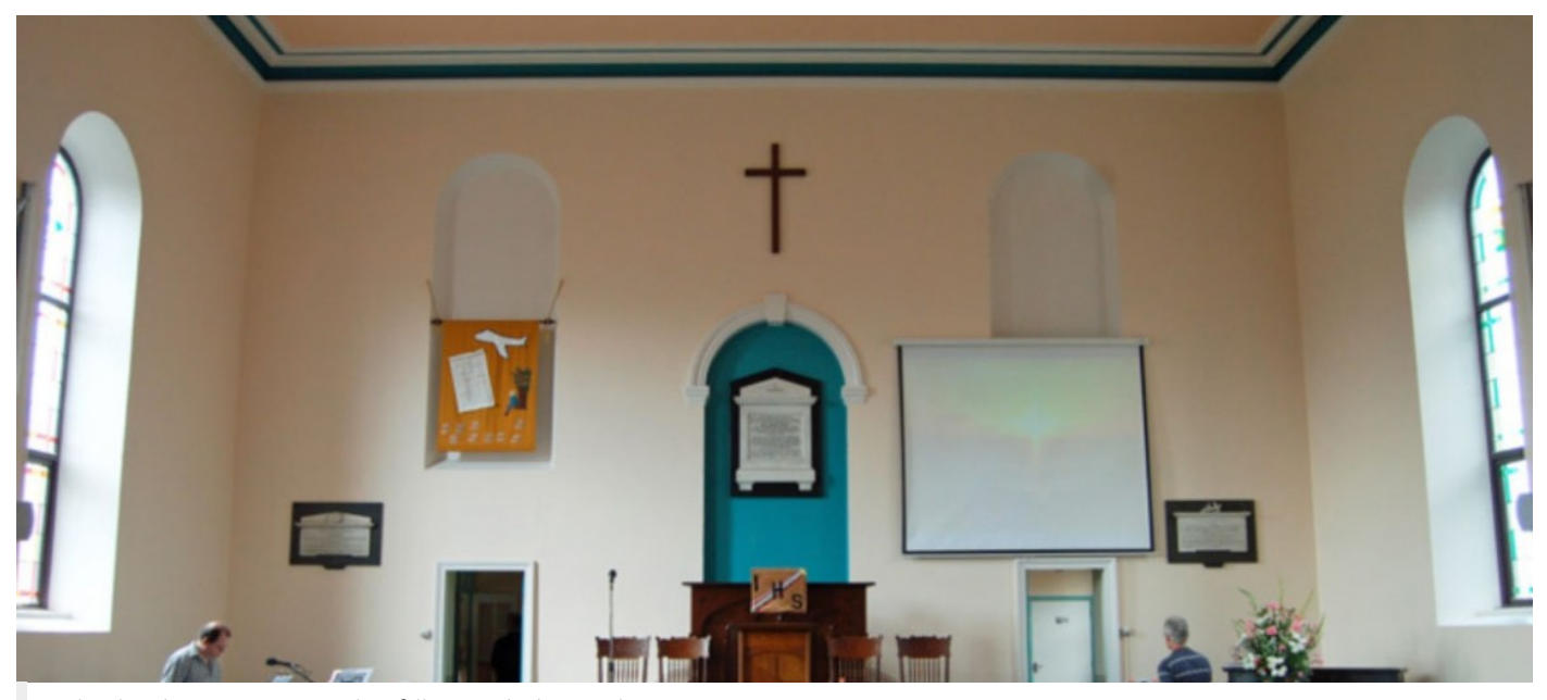
The church interior as it is today, following the latest redecoration in 2012.