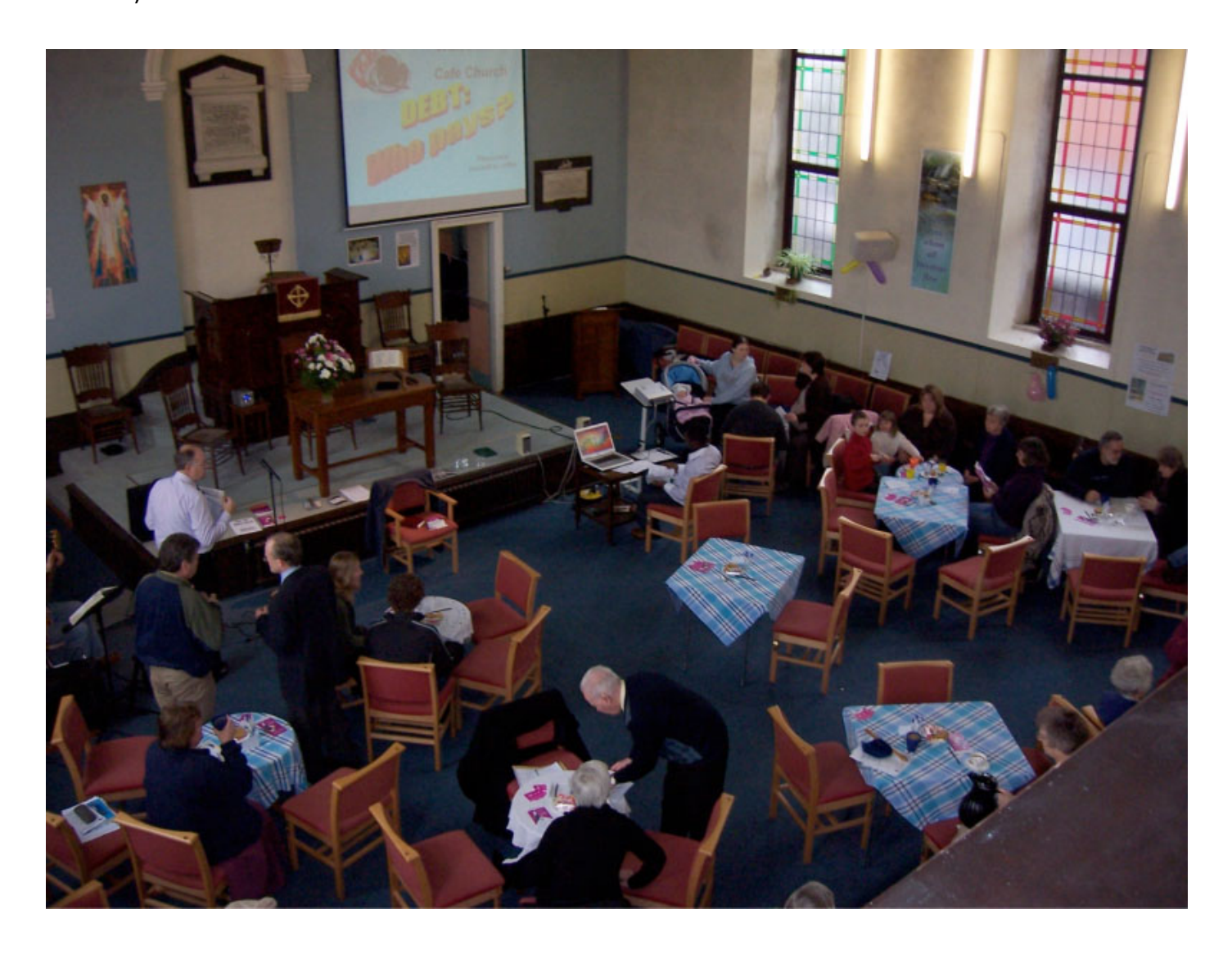
Typical 'Café Church', these services being held approx. six times per year.

First 'Café Church' service held, (with informal seating and coffee being served during service).