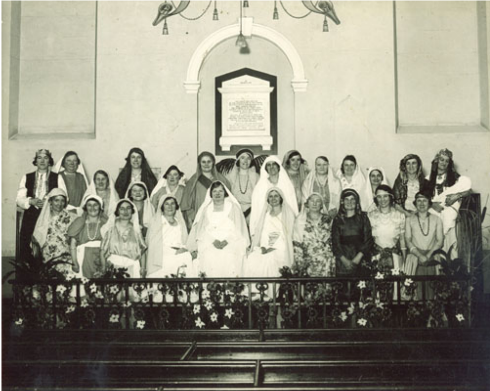
Ladies of the Church (late 1920s / early 1930s)

Recorded events from 1926 to December 1950