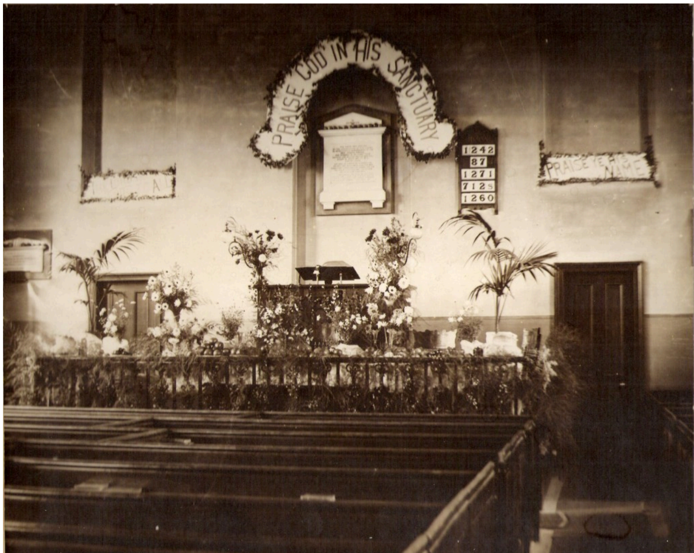
Church interior c.1906

Note the gas lamps on the pulpit and the pew doors