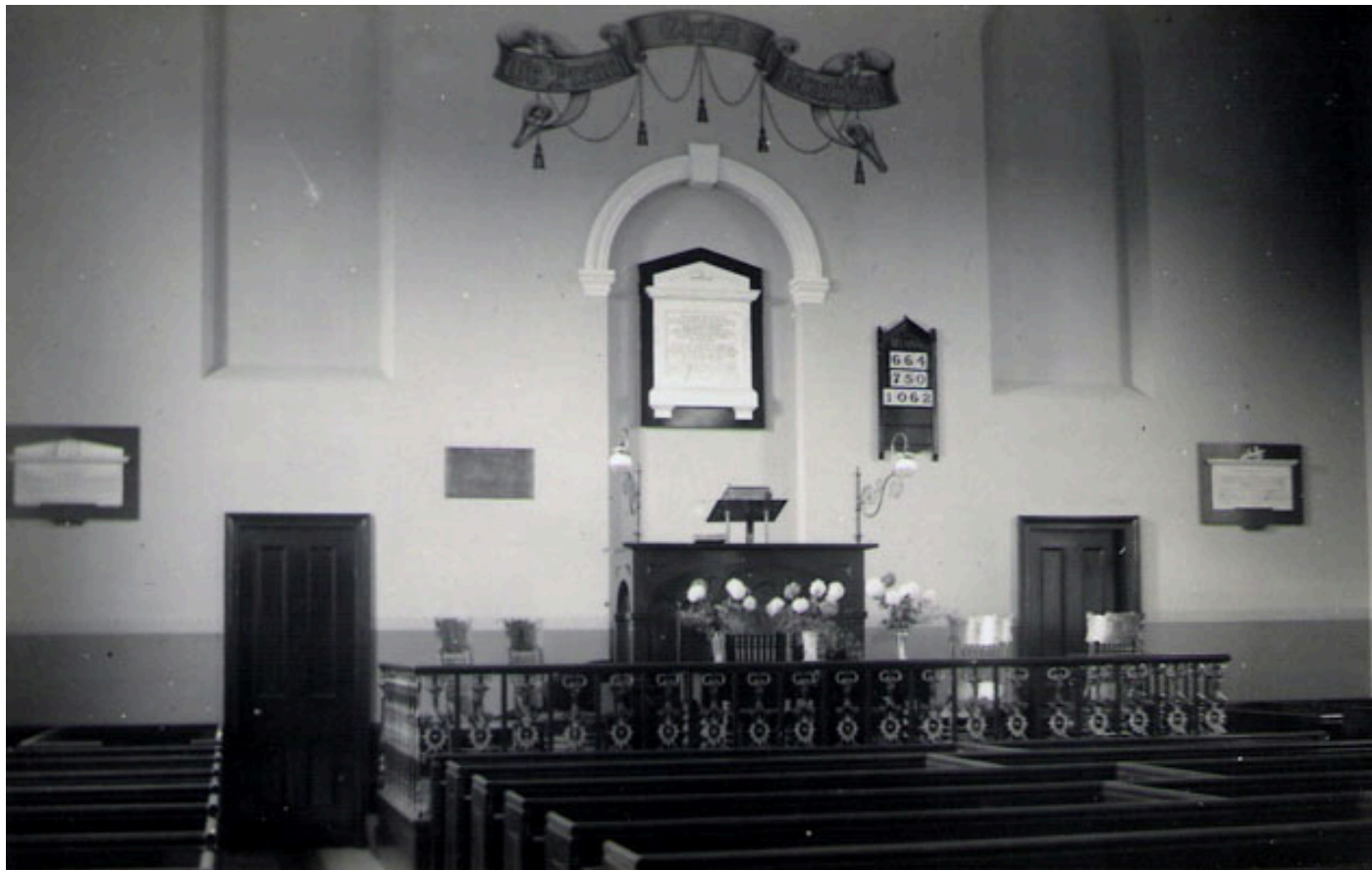
Church interior c.1925