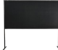
Horizontal Display Board