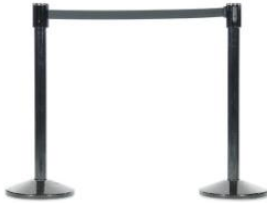
Stanchion with 7" Strap