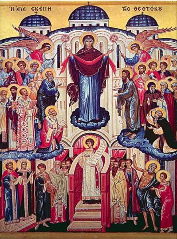
THE PROTECTION OF THE THEOTOKOS AND EVER-VIRGIN MARY – October 1 st –